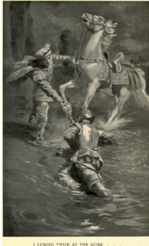
I LUNGED TWICE AT THE RIDER

The foremost and nearest to me was Clarence, whose horse began, half-way across, to swim. It was still scrambling to regain its footing when it came within my reach, and I slashed it cruelly across the nostrils. It turned in an instant on its side. I saw the rider's face gleam white in the water; his stirrup shone a moment as the horse rolled over, then in a second the two were gone down the stream. It was done so easily, so quickly, it amazed me. One gone! hurrah! I turned quickly to the others, who were about landing. My blood was fired, and my yell of victory, as I dashed at them, scared back two of the horses. Despite their riders' urging, they turned and scrambled out on the side from which they had entered. Only one was left, the farthest from me. He got across indeed. Yet he was the most unlucky of all, for his horse stumbled on landing, came down heavily on its head, and flung him at my very feet.