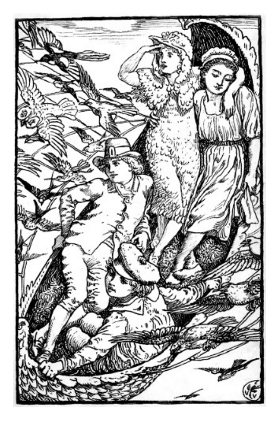
'All right—we're off now,' Waldo called out, and at once, with a steady swing, the queer ship rose into the air.

'But godmother,' exclaimed Maia, 'where is she? Isn't she coming with us?'