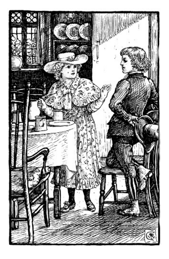
' Rollo ,' she exclaimed, her eyes sparkling, half with fear, half with excitement, 'I do believe we've got into the cottage of the three bears .'

Rollo burst out laughing, though, to tell the truth, he was not quite sure if his sister was in fun or earnest.