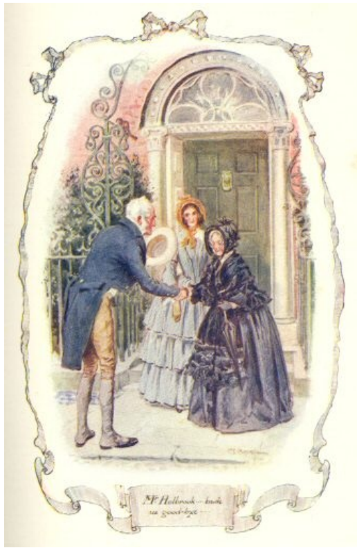
N. Holland - maak us good-bye