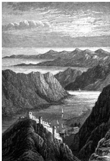
BOCICHE DI CATTARO. Page 48.

But the first view of that extraordinary fortress, Cattaro, is never to be forgotten. At the very head of the last arm of the Bocche the dark blue masses of mountain, here higher and more precipitous than elsewhere, shut in a deep bay.