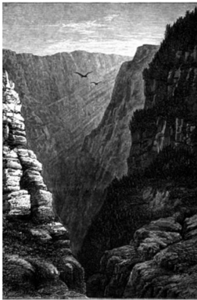
A SCIENTIFIC FRONTIER. Page 229.