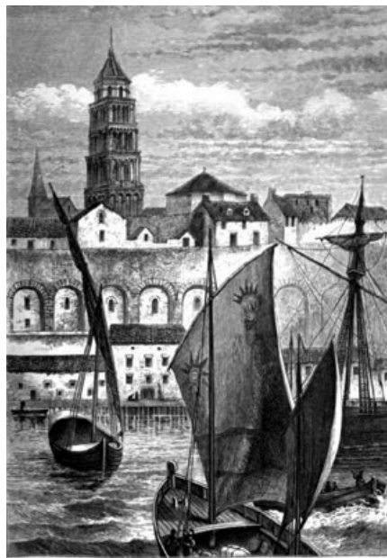
SPALATO. Page 26.

At nine o'clock this evening we were alongside the quay of Spalato. Bidding adieu to our friends on board, and promising our Turk to visit him at Scutari, we threw our baggage into a small boat manned by some ragged and noisy ruffians, whose language was so rapid and so horrible in sound, that I could not but admire them for their evident ability to understand each other, and inwardly formed a higher opinion of the intellectual capacity of this branch of the Slav race at any rate.