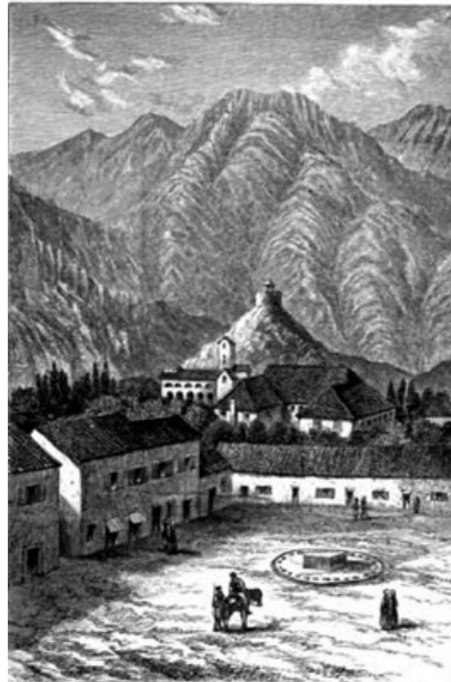
CETTINJE. Page 65.

At this Khan —having a large and appreciative audience round him—he favoured it with a lengthy lecture, with detailed explanations, followed, as far as I could make out, by a biography of the two English travellers. Startling it must have been, too, judging from the admiring and awe-struck way in which the men turned and stared at us during the narrative.