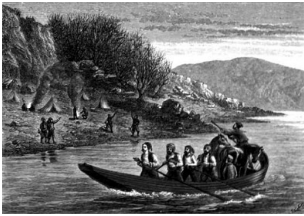
THE LONDRA. Page 102.

They do not make use of rollocks, but twist vine or clematis branches into grommets, which run through holes made for the purpose in the gunwale. These grommets soon wear out, and have to be replaced three or four times in a day's journey. The londra, notwithstanding its rough build, progresses at a very fair pace, so long as it does not meet with a strong head-wind, when its little hold on the water is much against it.