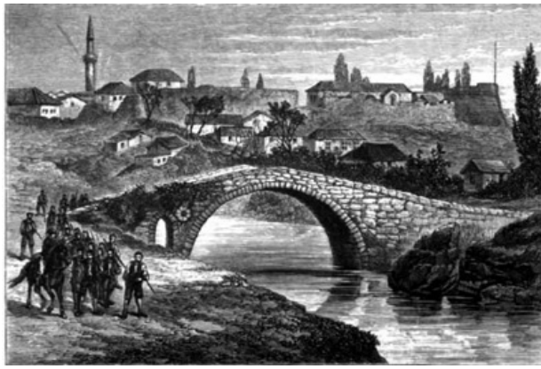
PODGORITZA. Page 177.