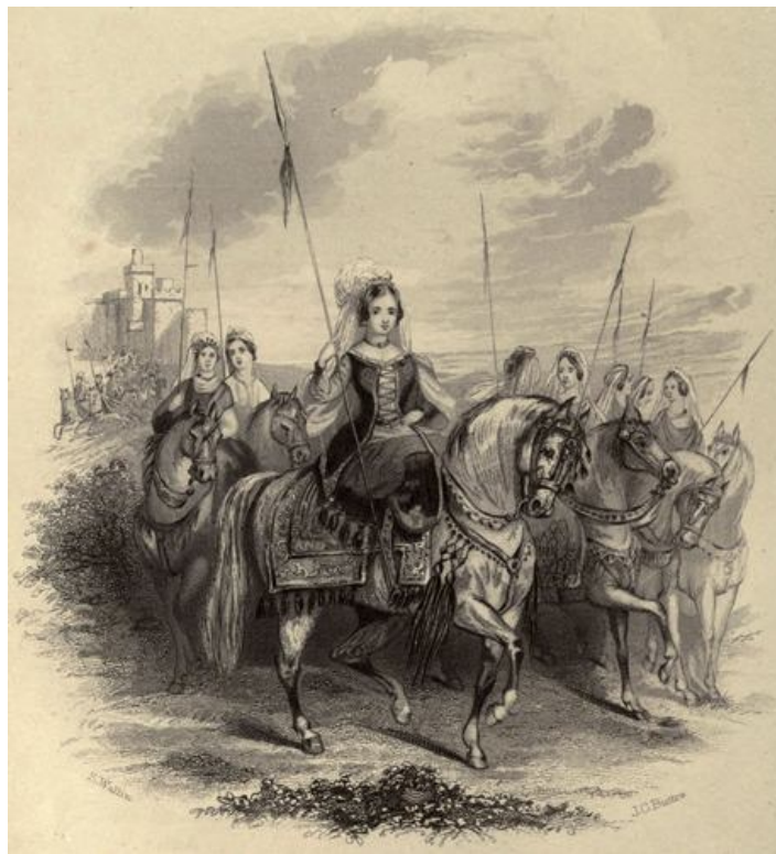
Eleanor of Aquitaine.