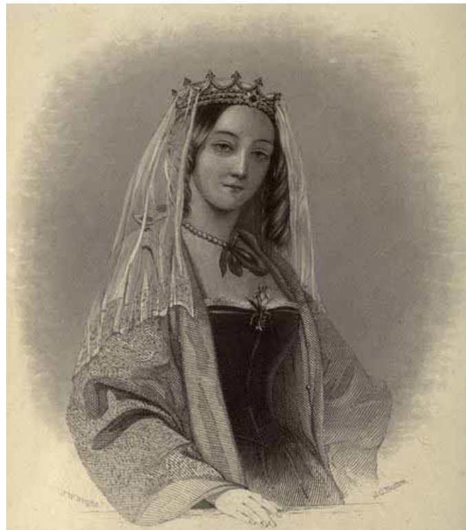
Berengaria of Navarre.