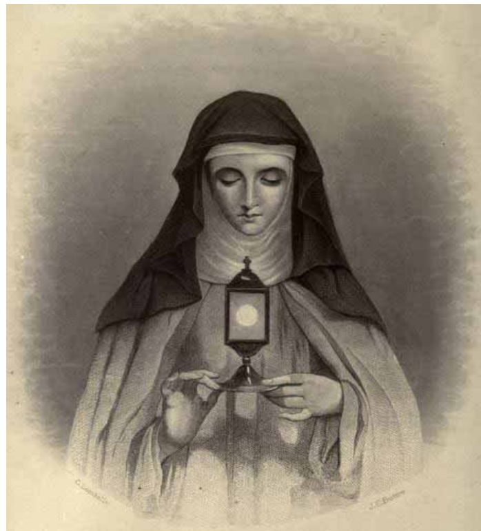
Isabella of Angoulême.