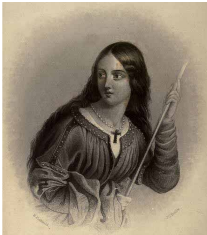
Adela. Countess of Blois.