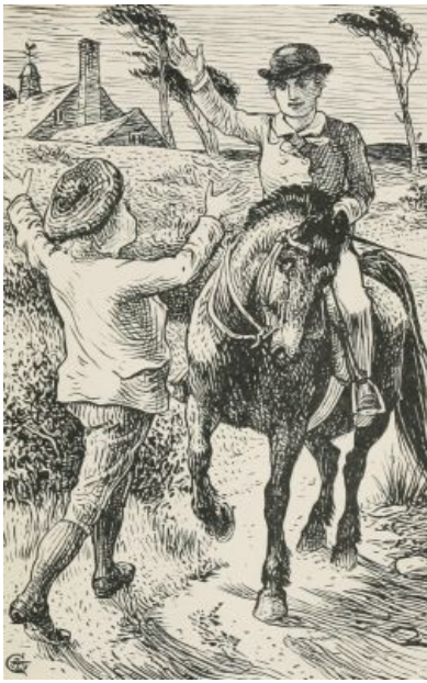
It was Fergus, little lame Fergus, mounted on a tiny rough-coated pony, coming towards him!

them last week, but there's been none of us down there much lately."