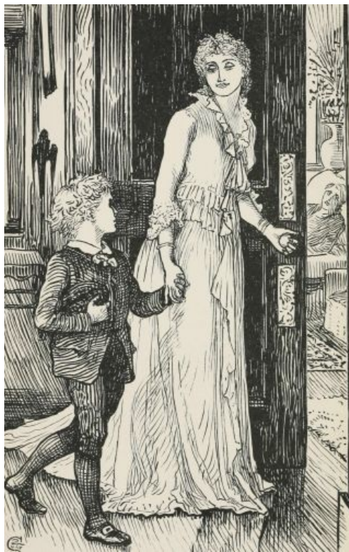
And thus she led him out of the large, cold hall.— Front.