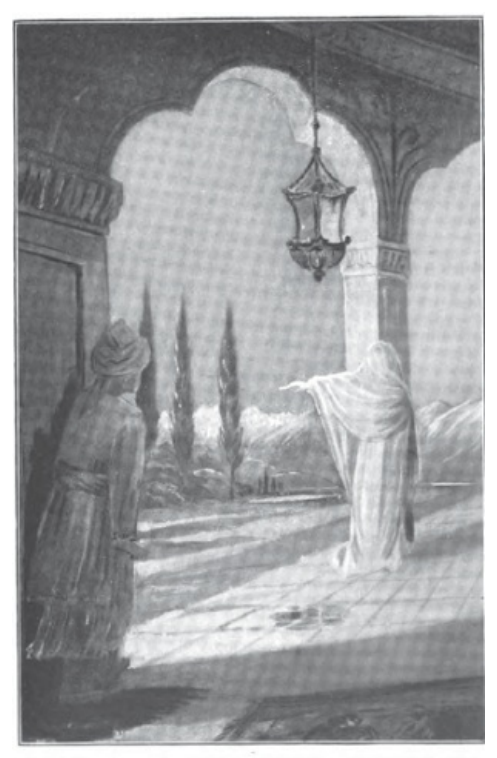
"'THIS SLAVE HAS A LETTER FOR THE MOST HIGH'" "'THIS SLAVE HAS A LETTER FOR THE MOST HIGH'"

impossible. Yet it fitted strangely with the place; with his vague feeling that had been beyond even Time and Space.