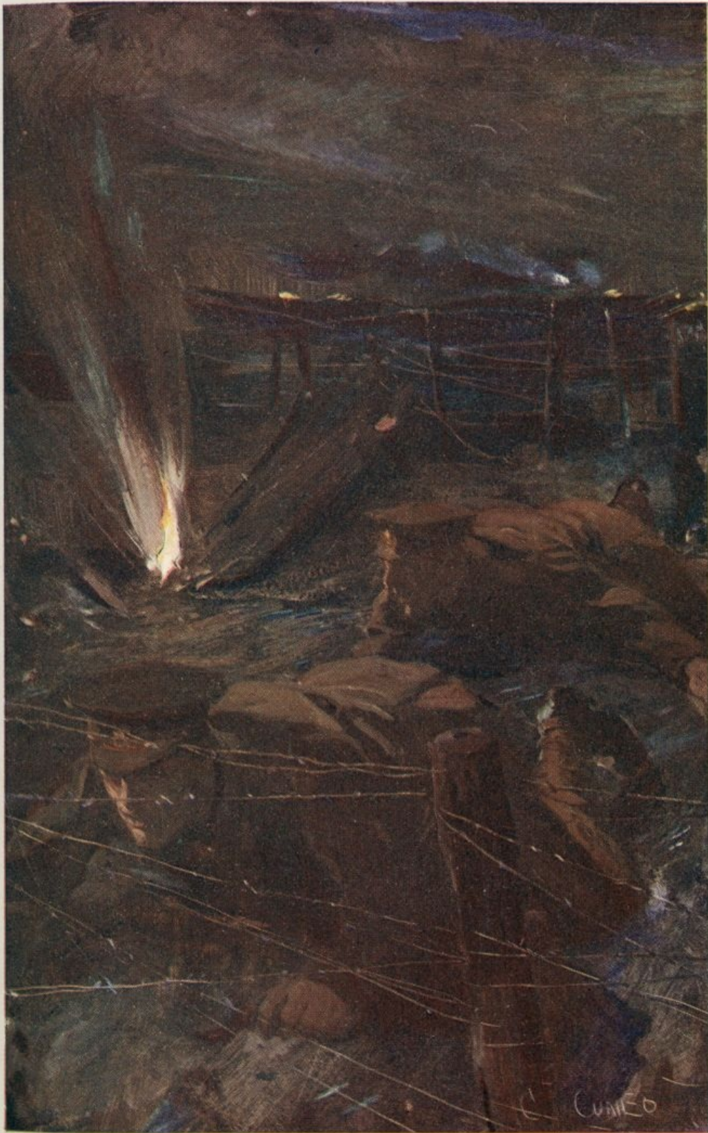
A LONG WAY BACK