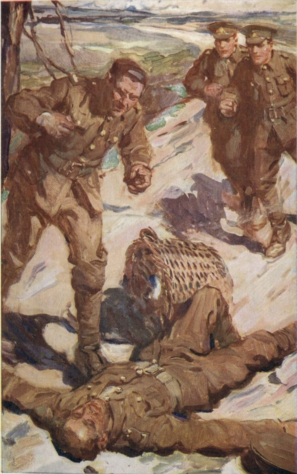
A FOUL BLOW