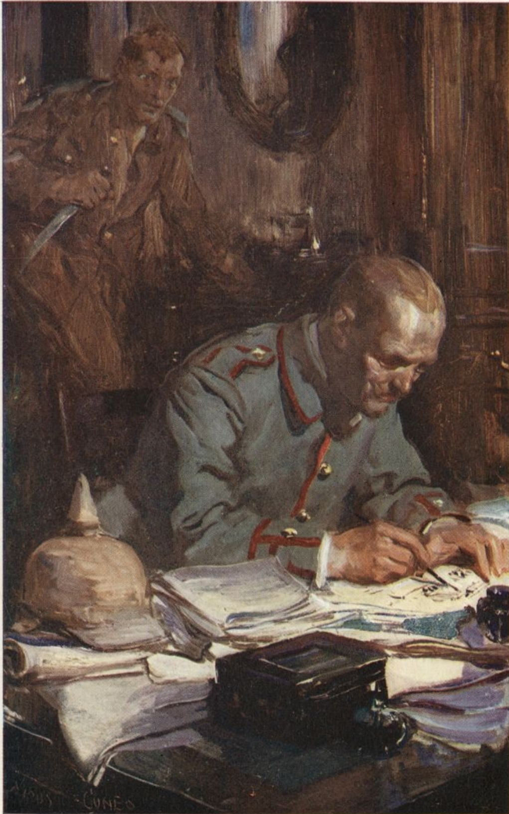
THE INTRUDER IN KHAKI

A little while after the officers had departed, a strange, unshaven, unkempt face peered round the edge of the door, which the colonel had left open. It was a lined and somewhat careworn face; the eyes were bright and wild; the hair, very rough and tangled, was red. The face moved slowly forward; inch by inch a dirty, tattered khaki uniform showed itself; and the rays of the lamp on the table glinted on the blade of a long carving knife, held in the man's right hand. He wore no boots, and his stockings made no sound as he tiptoed across the room.