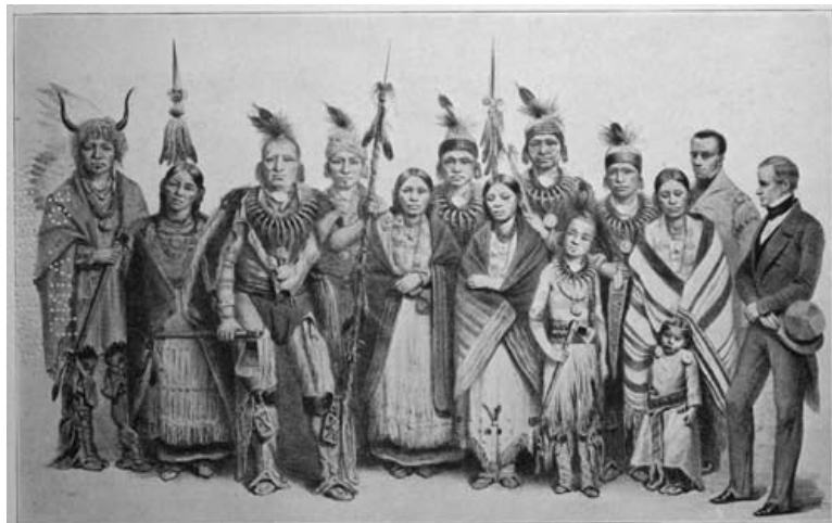
A GROUP OF IOWA