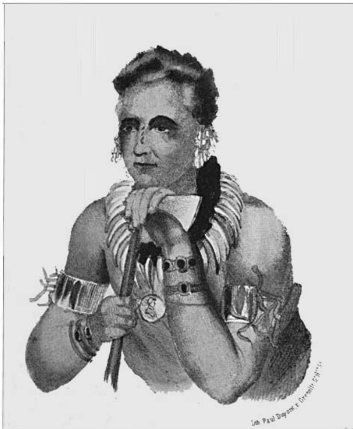
MA-HAS-KAH, THE YOUNGER