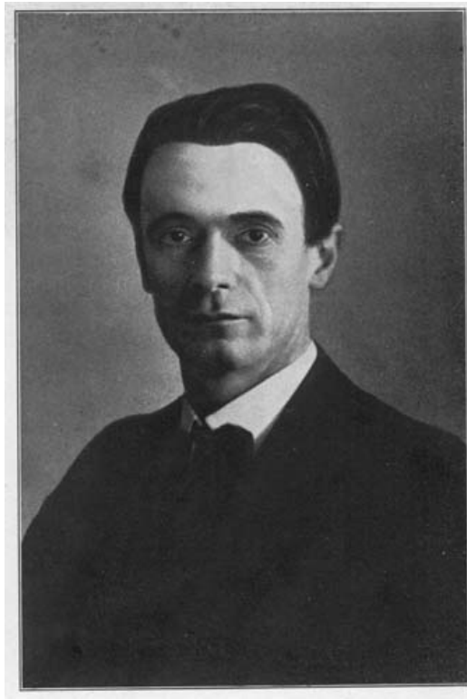
Dr. Rudolf Steiner