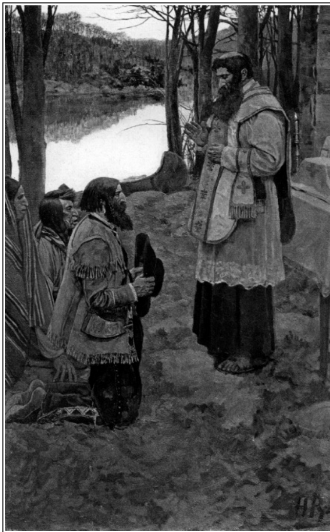
Father Hennepin Celebrating Mass. Drawn by Howard Pyle.