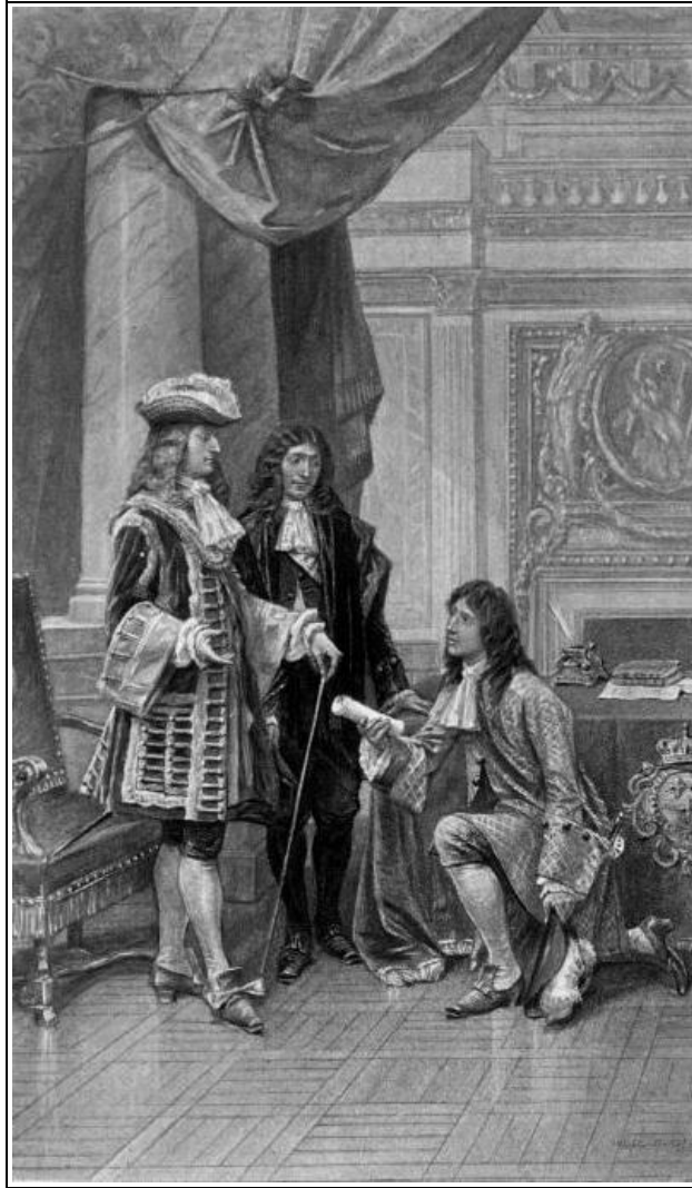
La Salle Presenting a Petition to Louis XIV. Drawn by Adrien Moreau. La Salle and the Discovery of the Great West, Frontispiece