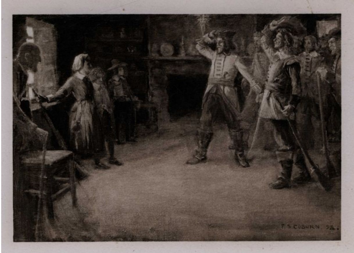
"Saluted the brave young captain."

And she blew a blast on the bugle, and lo! from the forest black. Merrily, merrily ringing, an answer came pealing back. Oh, pleasant and sweet it sounded, borne on the morning air, For it heralded fifty soldiers, with gallant De la Monnière.