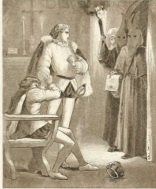
THE ALGUAZILS PRODUCING THEIR WARRANT FOR ARREST. page 22