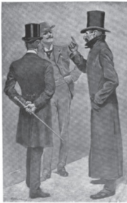
"What was the colour of your Gladstone bag, eh?" The Datchet Diamonds. [Page 82.]

"What was the colour of your Gladstone bag, eh?" The Datchet Diamonds. Page 82.