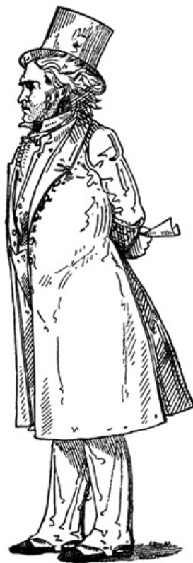
Ludwig van Beethoven

For additional Transcriber's Notes, click here .