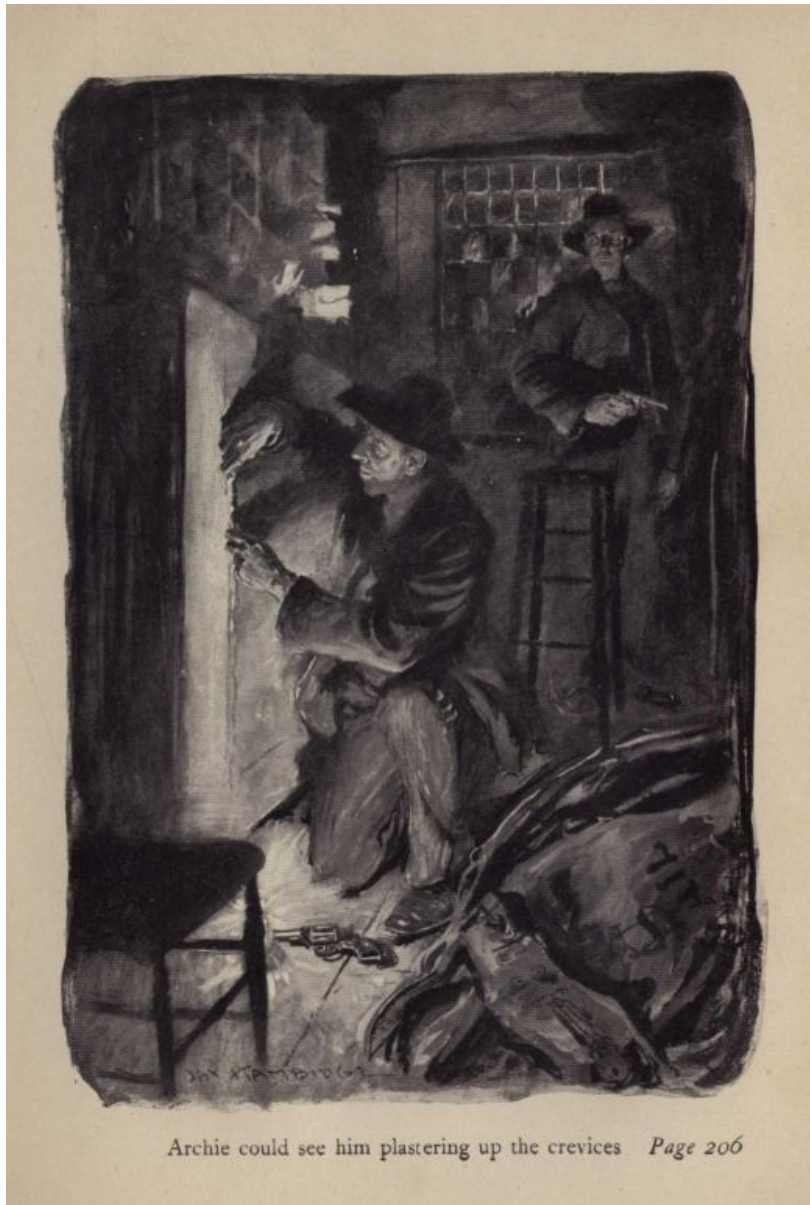
Archie could see him plastering up the crevices Page 206