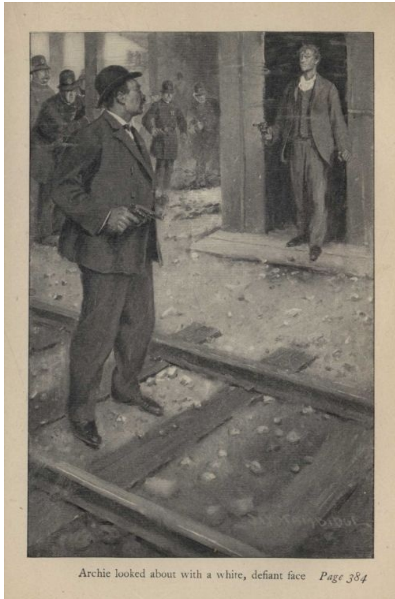
Archie looked about with a white, defiant face

But Archie stayed. The officer called again, Curly called, the crowd called; then the shooting began again. Presently Archie appeared in the doorway and looked about with a white, defiant face. And there, before him, a rod away, stood Kouka, revolver in hand. He saw Archie, his brow wrinkled, and he smiled darkly.