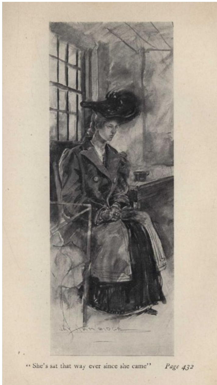
"She's sat that way ever since she came"

Elizabeth's glance swept the room which was Gusta's prison, its walls lined higher than her head with sheet-iron; on one side a narrow cot, frowsy, filthy, that looked as if it were never made, though the dirty pillow told how many persons had slept in it--or tried to sleep in it. There was a wooden table, with a battered tin cup, a few crusts and crumbs of rye bread, and cockroaches that raced energetically about, pausing now and then to wave their inquisitive antennæ, and, besides, a cheap, small edition of the Bible, adding with a kind of brutal mockery the final touch of squalor to the room.