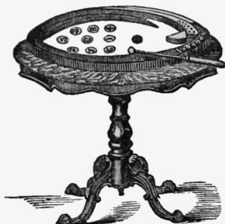
Patent Bagatelle Table--Open.