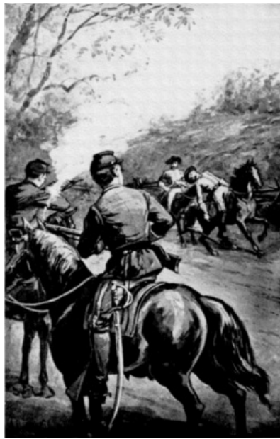
"One of the Texans tumbled from his horse."

Just at that moment a bullet whistled between the two boys; for the scouts could have no difficulty in making out the uniform of the two messengers. Both of them unslung their carbines; and, without considering what consequences might ensue, both of them fired, Artie delivering the first shot. One of the Texans tumbled from his horse, and Deck aimed at the other; but he was less fortunate in his discharge, for the remaining man still clung to his horse. Raising his carbine, he fired.