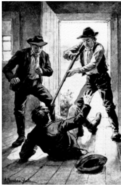
"'Help! Help!' shouted the victim."

The younger brother hastened to obey the order. Finding nothing of the description required, he rushed into the rear room of the house. The pressure of the assailant's hands upon his throat, and the hope of assistance from outside, stimulated the victim to further resistance, for the gun in the hands of Orly no longer threatened him. With a desperate struggle he threw Sandy over backwards, and sprang to his feet. His persecutor picked himself up, and was about to throw himself upon him again. Pickford, who was nearly exhausted by the struggle and the choking, rushed to the open door; and as he was about to pass out he encountered a young man in the uniform of a cavalryman, with a sabre dangling at his side, and a carbine slung on his back.