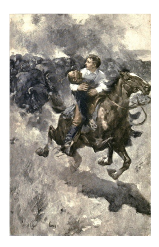
"JACK SWUNG HIS HEAD ROUND"