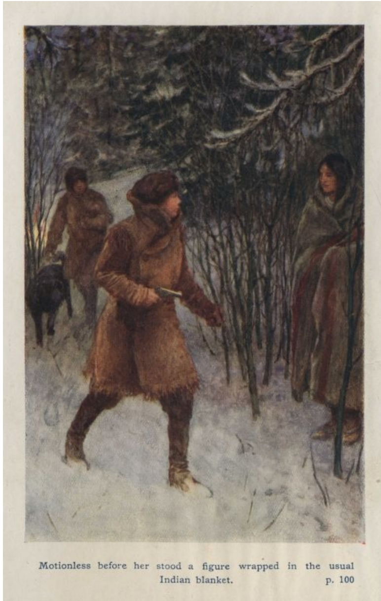
Motionless before her stood a figure wrapped in the usual Indian blanket. p. 100