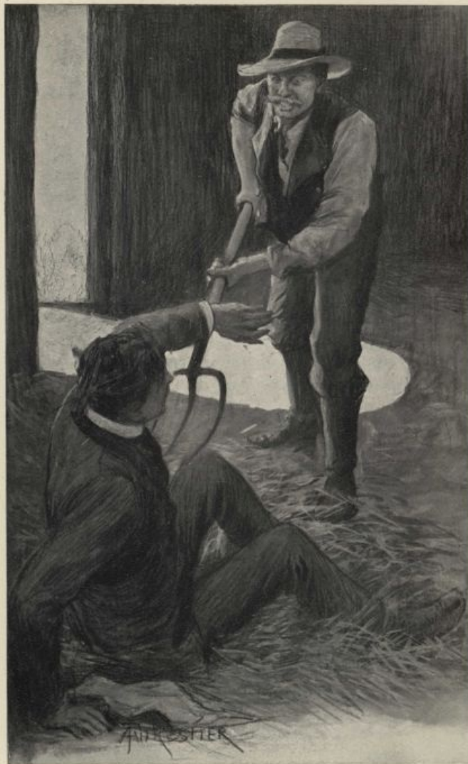
"I made an effort to rise, but he threatened me with the fork." An Imperial Marriage [Page 265]

"I made an effort to rise, but he threatened me with the fork." Page 265