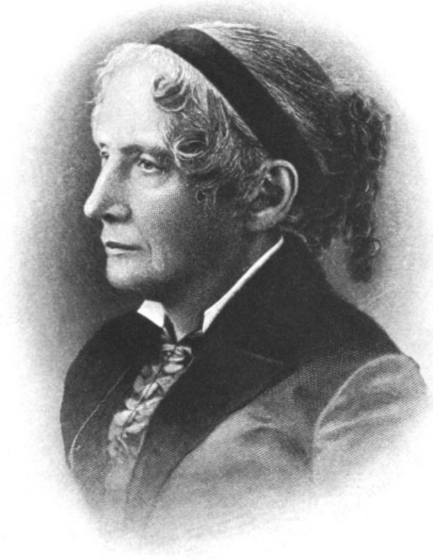
M rs . Beecher Stowe.

'Come, I think that's exaggerated,' observed Bambaev. "'Go away" she certainly did say, that's a fact, but she didn't give him a smack!'