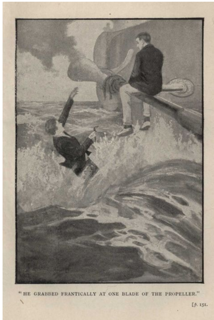
"HE GRABBED FRANTICALLY AT ONE BLADE OF THE PROPELLER."

"Pass me that long marline-spike, Gwennap," exclaimed Hythe. The man leant forward with the pointed piece of steel in his hand. As he did so a sea swept over him; he dropped the marline-spike and grabbed frantically at one blade of the propeller; missed it, and the next instant was struggling in the sea.