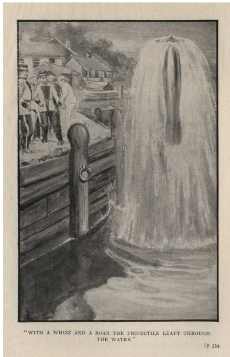
"WITH A WHIZZ AND A ROAR THE PROJECTILE LEAPT THROUGH THE WATER."

With a whizz and a roar the projectile leapt through the water and soared four hundred feet in the air. There it burst, the concussion shaking every miserable hovel in Marromea to its foundations. When the "Aphrodite" returned to the surface the quay was deserted; the terrified officials, suffering with injured ear-drums, were skulking in the bush.