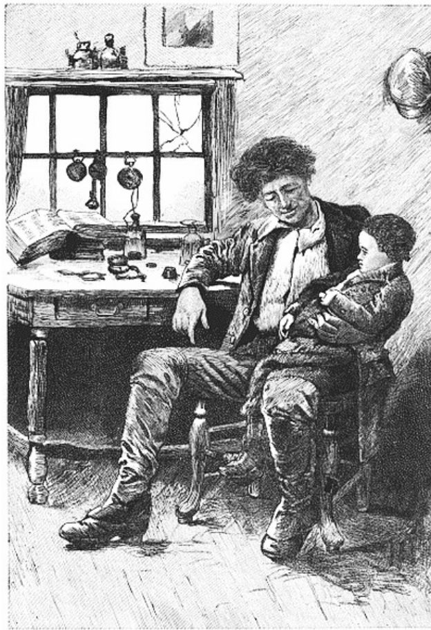
FELIX HOLT AND JOB TUDGE.

"Mother," said Felix, who often amused himself and kept good-humored by giving his mother answers that were unintelligible to her, "you have an astonishing readiness in the Ciceronian antiphrasis, considering you have never studied oratory. There, Job—thou patient man—sit still if thou wilt; and now we can look at Miss Lyon."