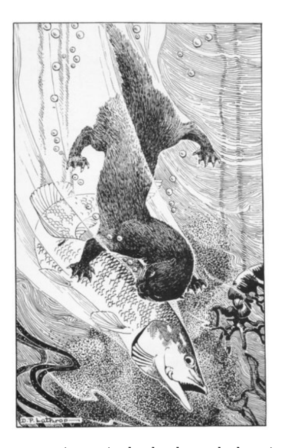
"A wild chase was going on in the depths, and where it passed the rushes bowed their sheaves."

*** START OF THE PROJECT GUTENBERG EBOOK GRIM: THE STORY OF A PIKE ***