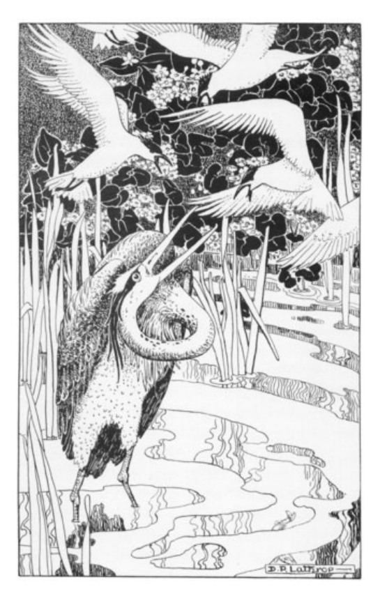
"With a hiss it curves its neck and turns the foil upwards, snapping and biting at its tormentors."

Sea-crows and terns scream around it, and from time to time three or four of them unite in harrying their great rival. Just as the heron has brought its beak close to the surface of the water, ready to seize its prey, the gulls dash upon it from behind. With a hiss it curves its neck and turns the foil upwards, snapping and biting at its tormentors.