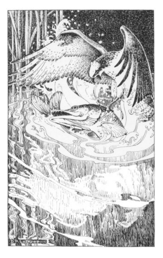
"The bird darts upon her from behind with outstretched claws, and drives them with full force into her back."

Its body is partly in the water, but the wings are quite clear, and it flaps vigorously, knowing it must lift its treasure with a quick movement.