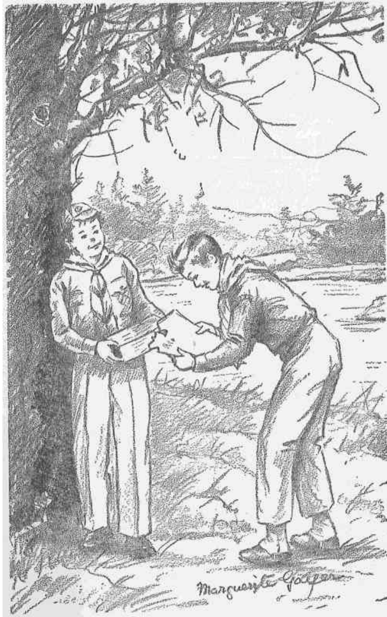
He had found a small cardboard box. "DAN CARTER—CUB SCOUT AND THE RIVER CAMP" ( See Page 13 )