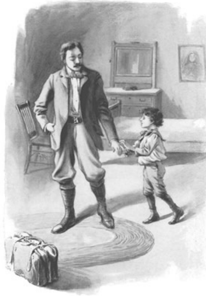
"THEY WERE FRIENDS."

There was, indeed, a resemblance between their two heads. Both had pale, inscrutable faces, dark eyes, and curls like midnight clustering over their white foreheads. Both were serious, grave, and reserved in expression. The child stared up at Vesper, then, seizing one of his hands, he patted it gently with his tiny fingers. They were friends. [Pg 60]