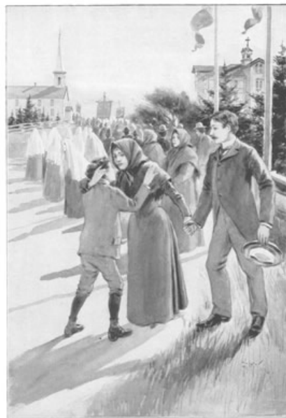
"THROWING HER ARM AROUND THE NECK OF HER RECOVERED CHILD."

She did not hesitate an instant. She did not even seem to be surprised. An expression of joyful surrender sprang to her face; in silent, solemn ecstasy she took her lover's hand, and, throwing her arm around the neck of her recovered child, she started with them on the long road down the Bay.