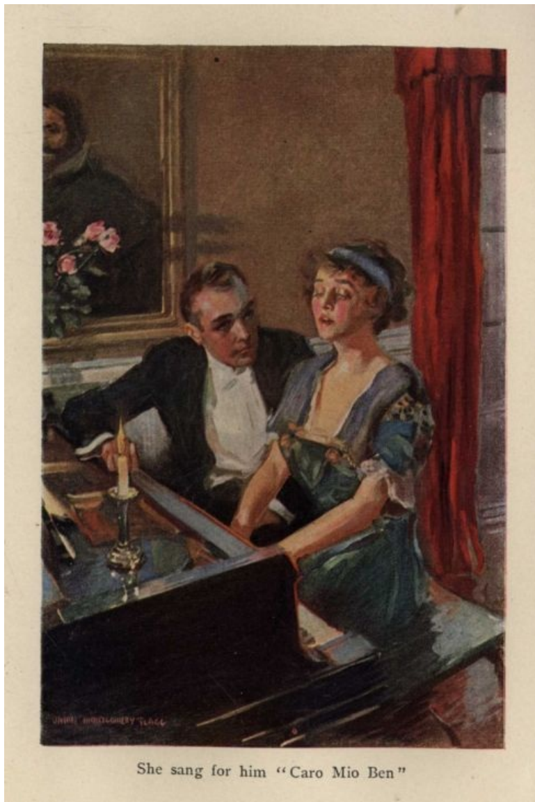
She sang for him "Caro Mio Ben"