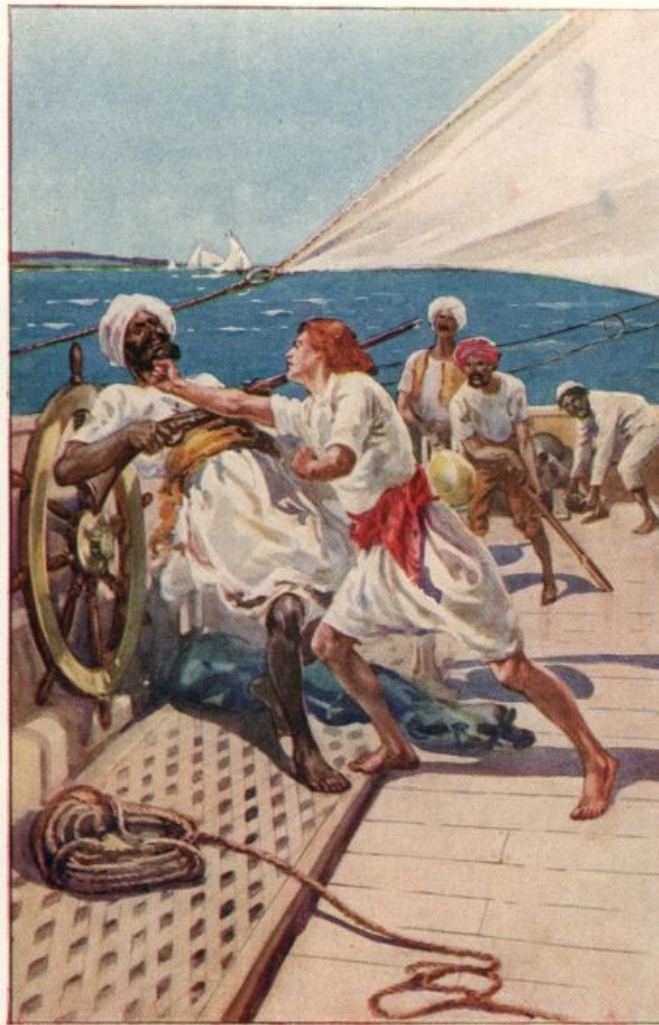
A SHORT WAY WITH MUTINEERS.