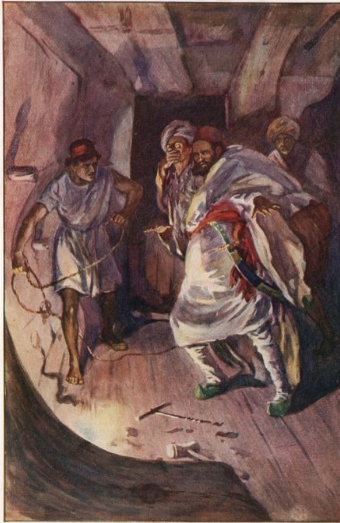
THE SUBAHDAR FALLS INTO THE TRAP.