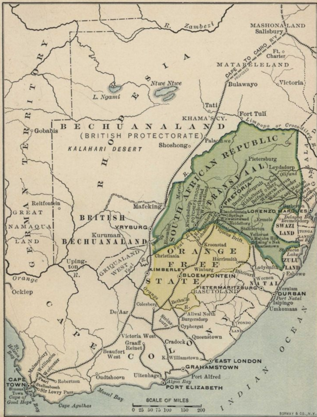
Map of South Africa.