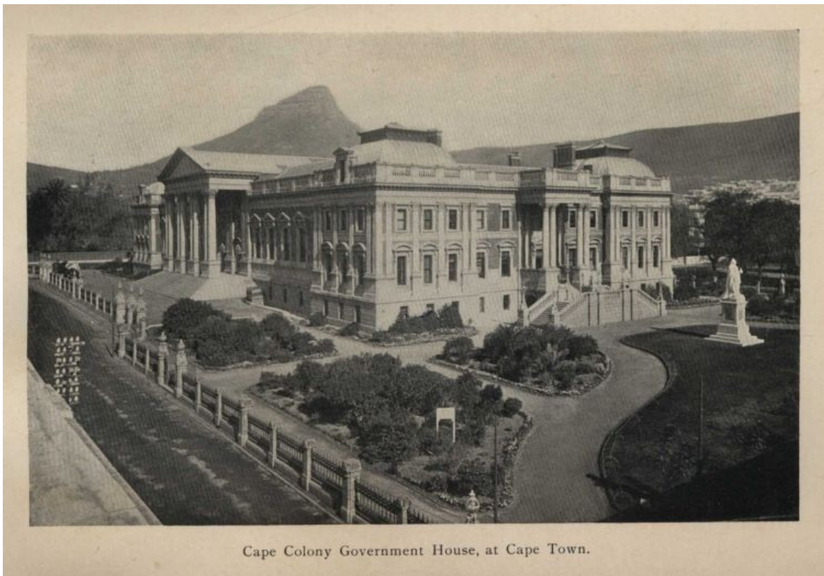
Cape Colony Government House, at Cape Town.