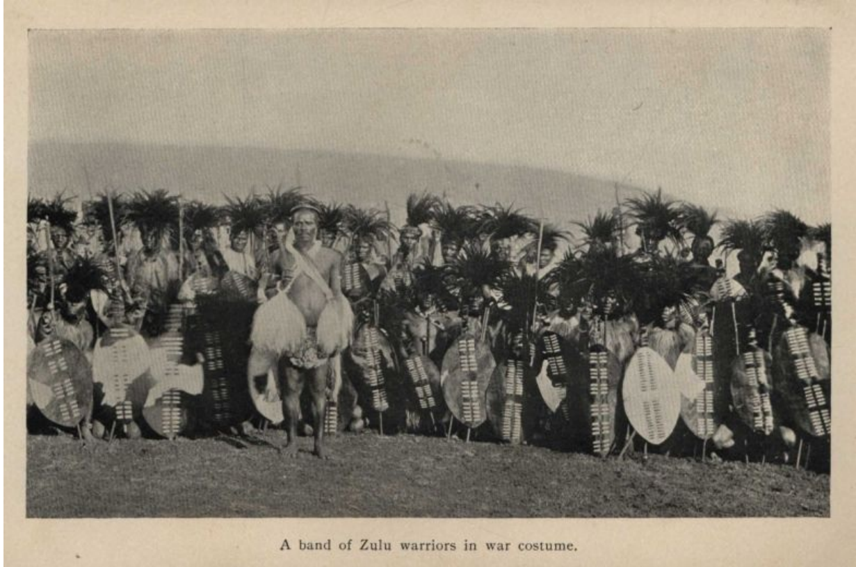
A band of Zulu warriors in war costume.

The "impi" swept down upon the camps by night, and murder of the foulest description prevailed. The Zulus spared none; men, women, and children, cattle, goats, sheep, and dogs--all fell under the ruthless assegais in the hands of the treacherous savages. In the confusion and darkness a few of the Boers escaped, among them having been the Pretorius and Rensburg families, which have since been high in the councils of the Boer nation. Fourteen men and boys took refuge on a hill now called Rensburg Kop, and held their assailants at bay while they improvised a "laager."