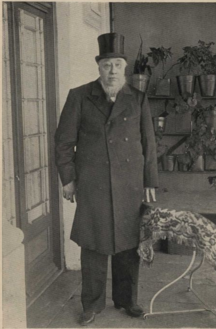
President Kruger on the piazza of the Executive Mansion, Pretoria.