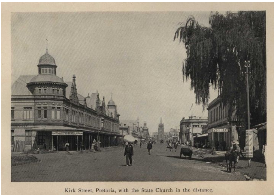
Kirk Street, Pretoria, with the State Church in the distance.

With the Boer his religion is his first and uppermost thought. The Old Testament is the pattern which he strives to follow. The father of the family reads from its pages every day, and from it he formulates his ideas of right and wrong as they are to be applied to the work of the day. Whether he wishes to exchange cattle with his neighbour or give his daughter in marriage to a neighbour's son, he consults the Testament, and finds therein the advice that is applicable to the situation. He reads nothing but the Bible, and consequently his belief in its teachings is indestructible and supreme.