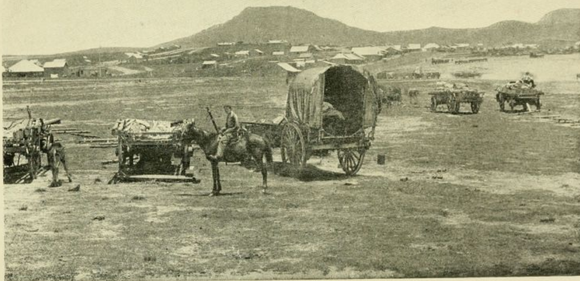
Majuba Hill, where one hundred and fifty Boer volunteers defeated six hundred British soldiers.