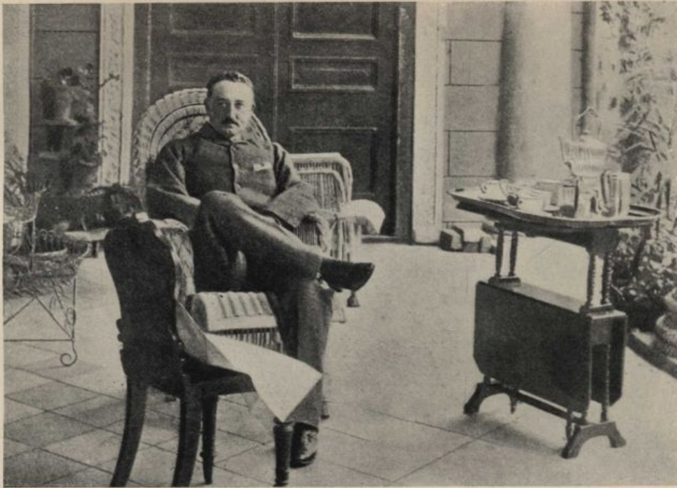
The Rt. Hon. Cecil J. Rhodes on the piazza of his residence, Groote Schuur, at Rondebosch, near Cape Town.