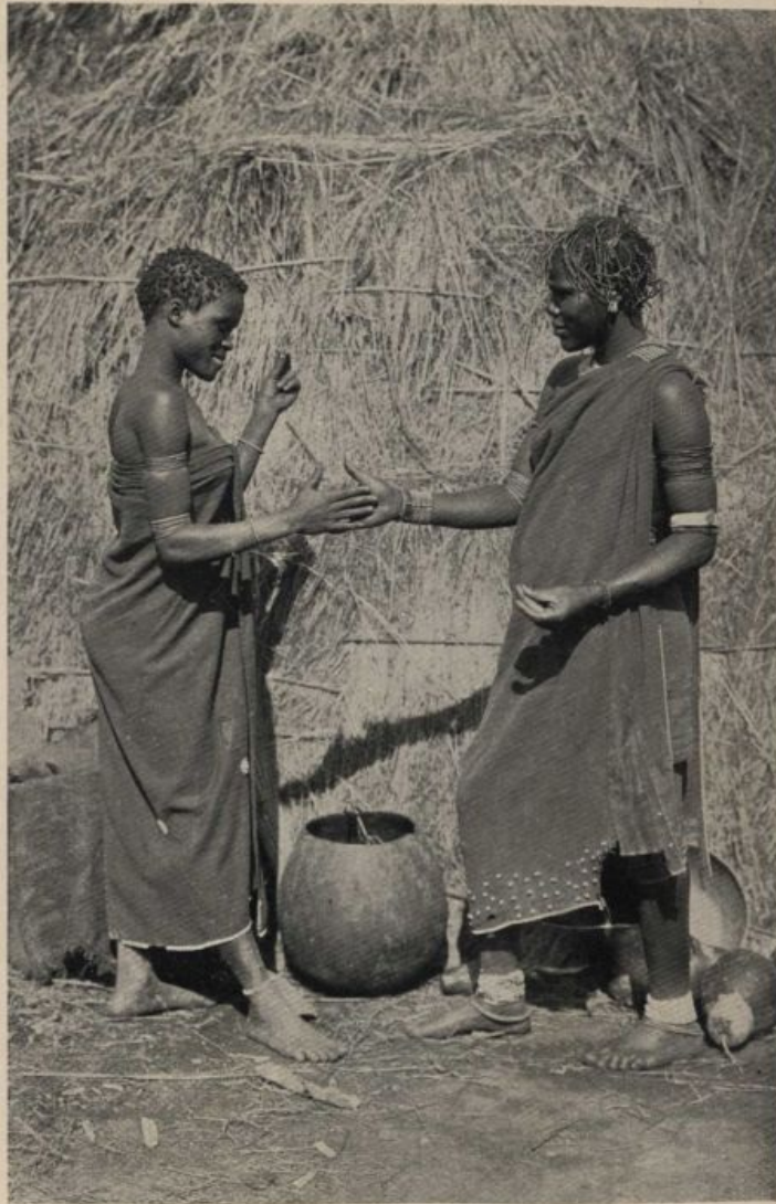
Zulu maidens shaking hands.