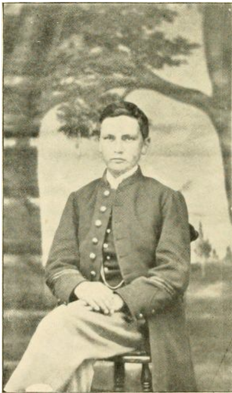
THE AUTHOR—A WAR-TIME PHOTOGRAPH.