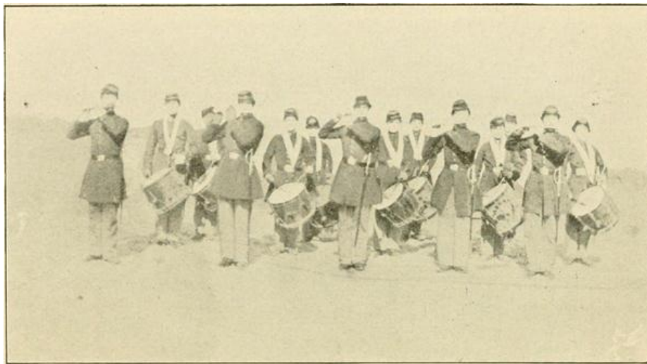
DRUM CORPS OF THE 2ND NEW YORK HEAVY ARTILLERY.

"Why, Bill, what in thunder you goin' to do that for? I should think that you'd had enough of ffin' and drummin' for awhile."