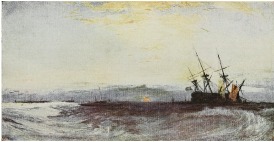
PLATE I.—A SHIP AGROUND.

From the oil painting by Turner in the Tate Gallery. (Frontispiece)