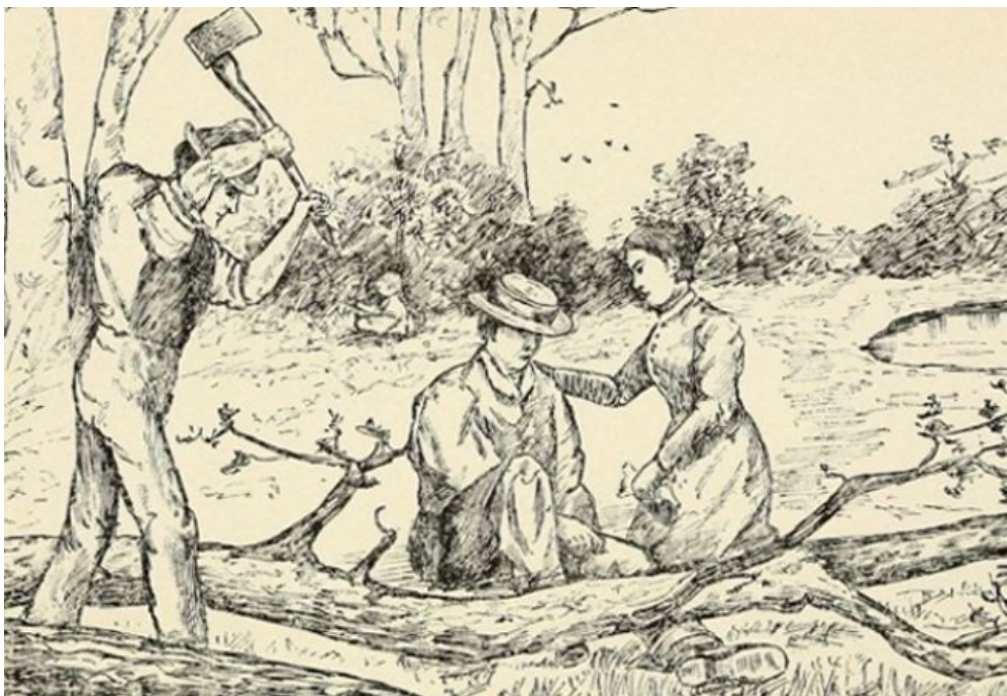
"Where are you hurt, William?" asked Aunt Nancy anxiously.—Page 252.

Jack soon found the tool, and, working very cautiously lest he should cause the sufferer yet more pain, chopped here and there to remove the larger twigs, while Aunt Nancy bathed Bill's pale face with her handkerchief wetted in the pond.