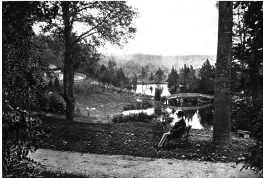
William Cullen Bryant at "Cedarhurst," Roslyn