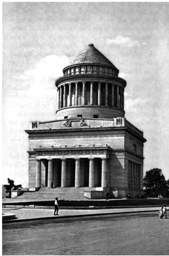
Grant's Tomb, New York