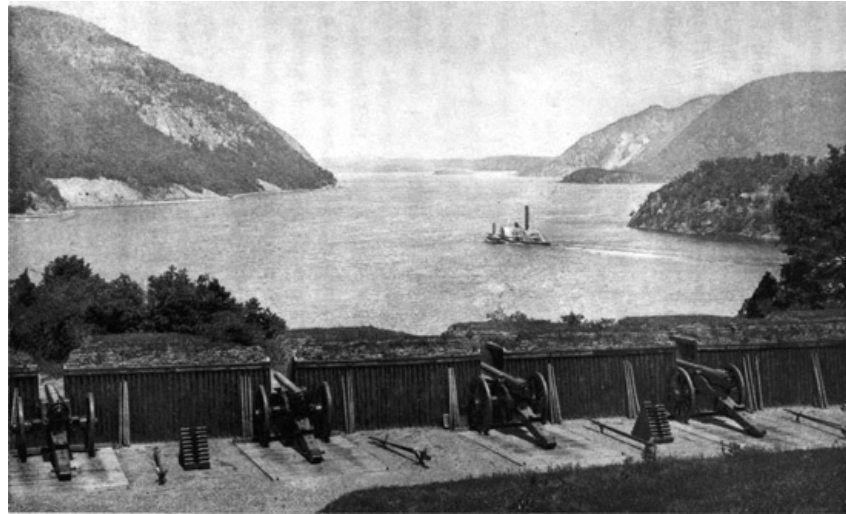
Up the Hudson from the Water Battery, West Point

"Where Hudson's wave o'er silvery sands Winds through the hills afar, Old Cro' Nest like a monarch stands Crowned with a single star."