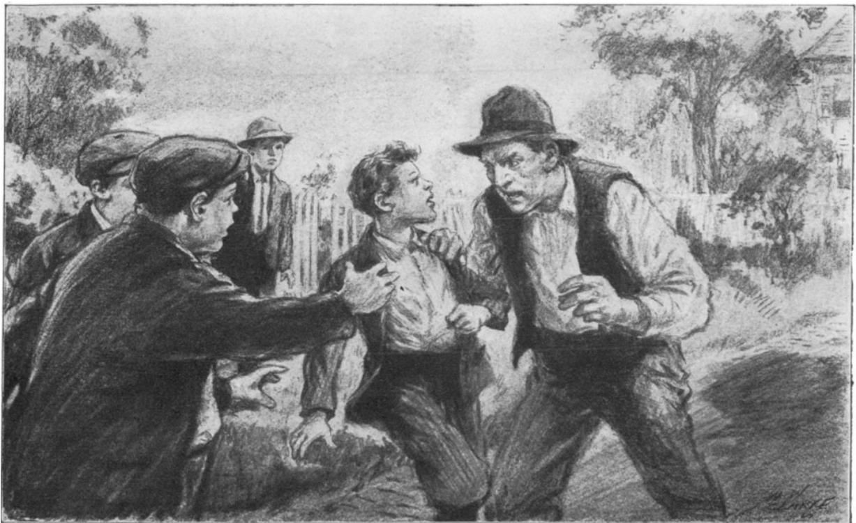
Jethro just rushed at us and grabbed a-holt of Rock, rough-like.

We started back, with Rock looking pretty dubious over his prospects. If he had known Mark Tidd as well as we did he wouldn't have felt so much that way, though I'll admit I wouldn't have been tickled to death if I'd been in his place.