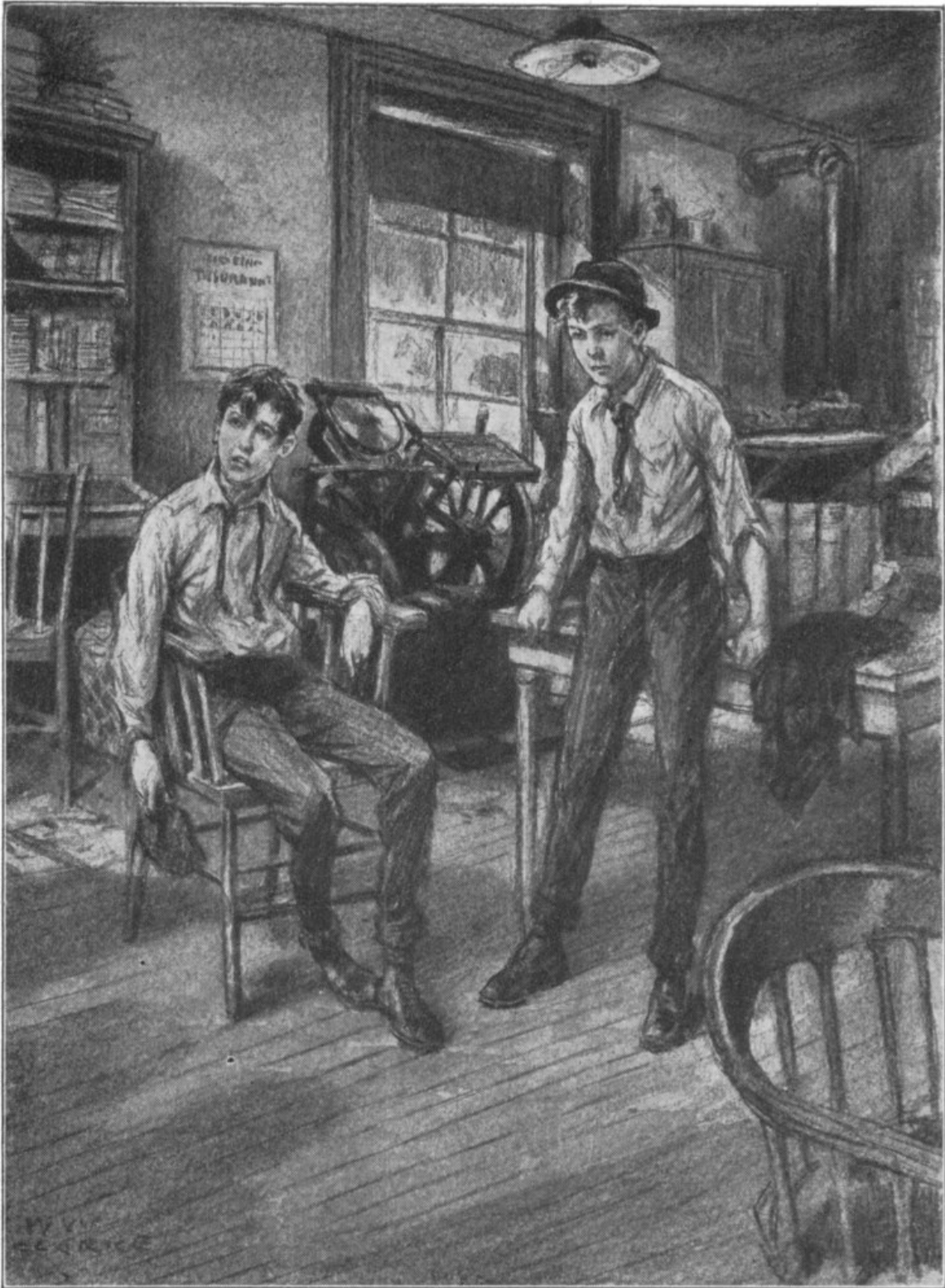
Plunk and Tallow were there looking dilapidated and frightened