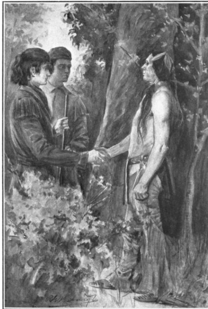
THEY ASKED HIM TO GO WITH THEM.

In an instant Lone-Elk was on his feet. With head thrown back and flashing eyes he repeated the story of the cloud which drifted over the lake—repeated again the whole miserable tale he had told so many times before. Then he exhibited the hatchet taken from the shock of corn on which a crow of most strange appearance had the same day been seen.