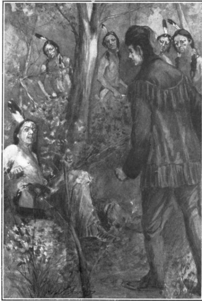
HE WHEELED AND SENT THE REDSKIN SPRAWLING.

The dawn came just when John had ceased to look for and momentarily expect it. Indeed, he was quite surprised to notice suddenly that objects near were again visible. He made out nothing clearly, but he could see a few feet in each direction and it was enough. Without hesitation, and almost without stopping to note the way he was taking, he headed instinctively toward the old poplar and without the least trouble reached its shelter not many minutes later.