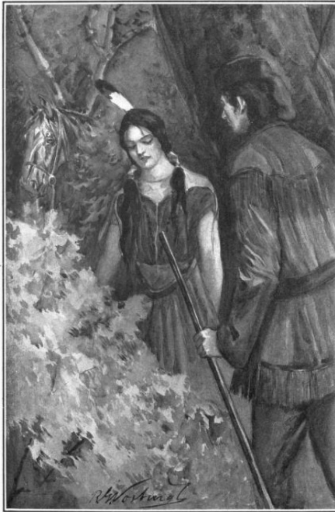
"THE CUSTOM IS THAT THE WITCH MUST DIE."