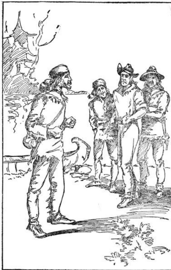
"A fight! a fight! make a ring for them."

"I am sure it is immaterial with me whether you believe it or not. If I were a member of the Northwest Fur Company, I should not be ashamed or afraid to own it, as I believe that is as respectable and honorable as the one in whose service you are."