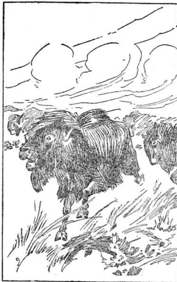
"Gave a snort of alarm and plunged headlong away into the droves."

We approached within a short distance. They were more scattered upon the outside, and with a little trouble the trapper managed to insinuate himself among them. His object was to drive off a cow which had a couple of half-grown calves by her side, but they took the alarm too soon, and rushed off into the drove. We then prepared to bring down one apiece. I selected an enormous bull, and sighted for his head. I approached nigh enough to make my aim sure, and fired. The animal raised his head, his mouth full of grass, and glaring at me a moment, gave a snort of alarm and plunged headlong away into the droves. At the same instant I heard Nat's rifle beside me, and a moment after that of the trapper. This gave the alarm to the herd. Those near us uttered a series of snorts, and dropping their bushy heads, bowled off at a terrific rate. The motion was rapidly communicated to the others, and in a few seconds the whole eastern side was rolling simultaneously onward, like the violent countercurrent of the sea. The air was filled with such a vast cloud of dust that the sun's light was darkened, and for a time it seemed we should suffocate. We remained in our places for over an hour, when the last of these prairie monsters thundered by. A strong wind carried the dust off to the west, and we were at last in clear air again. Yet our appearance was materially changed, for a thin veil of yellow dust had settled over and completely enveloped us, and we were like walking figures of clay.