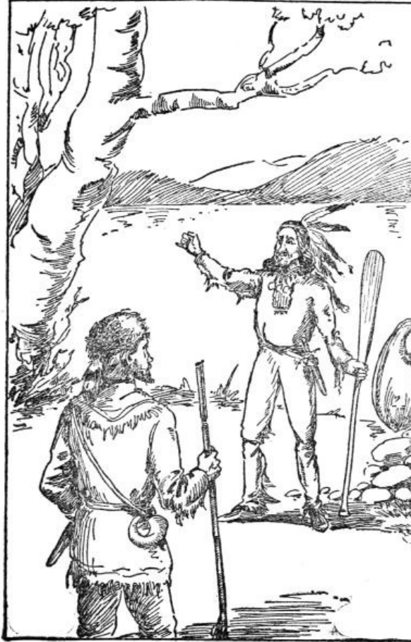
"No less personage than Nat stepped ashore."

"Yes, it is," replied the same natural, cracked voice.