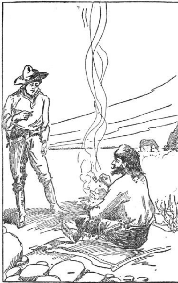
"What's your handle, stranger?"

"Sometimes I does, and sometimes I doesn't."