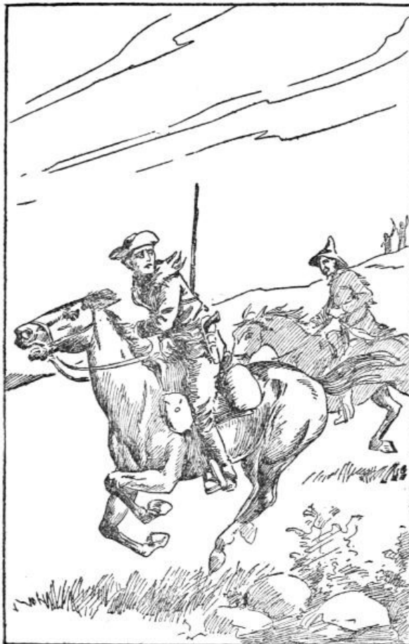
"Looking back saw a host of savage forms."

With this, Bidon wheeled his horse quickly around, and vanished from his place with the speed of lightning, while ours almost simultaneously shot ahead like an arrow. An instant after, I heard the faint discharge of guns, and, looking back, saw a host of savage forms pouring hastily from the timber.