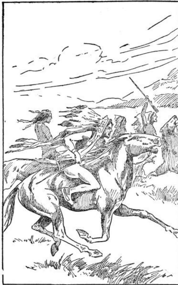
“Setting up a wild yell, the Indians scattered and plunged after them.”

Our animals now partook of the excitement of their masters. Arching their necks, they scented the prey afar, and it was nearly impossible to restrain their impatience. They snorted, and plunged, champed their bits, and shook their heads, and seemed determined to rush forward despite all restraint.