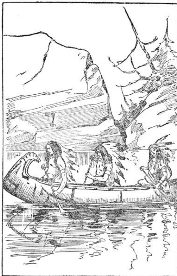
"In the stern, with a guiding oar, sat a young female."

My eye was still resting upon the glistening bend of the river above, when the quietness of the scene was interrupted by a dark speck which suddenly came in view, around a curve about a mile above. At first I supposed it to be some animal or log floating upon the surface; but as I looked at it, I saw to my astonishment that it was a canoe coming down-stream. Several forms were visible, yet their number, at that distance, was uncertain. The bright flash of their paddles was visible in the morning sunshine, and they maintained their place near the center of the stream.