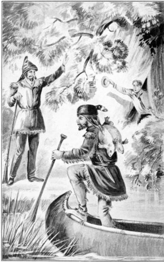
THE TRAPPER'S HOME.