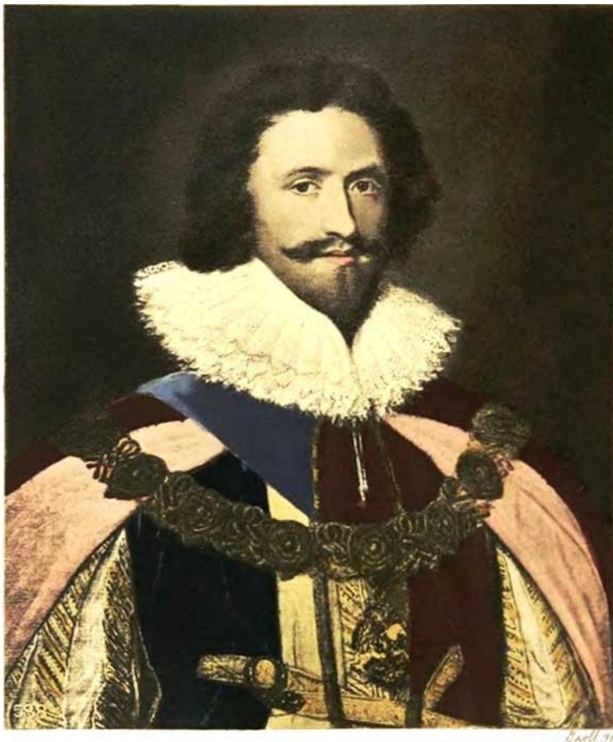
THE DUKE OF BUCKINGHAM