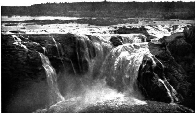
Chaudière Falls, St. Lawrence