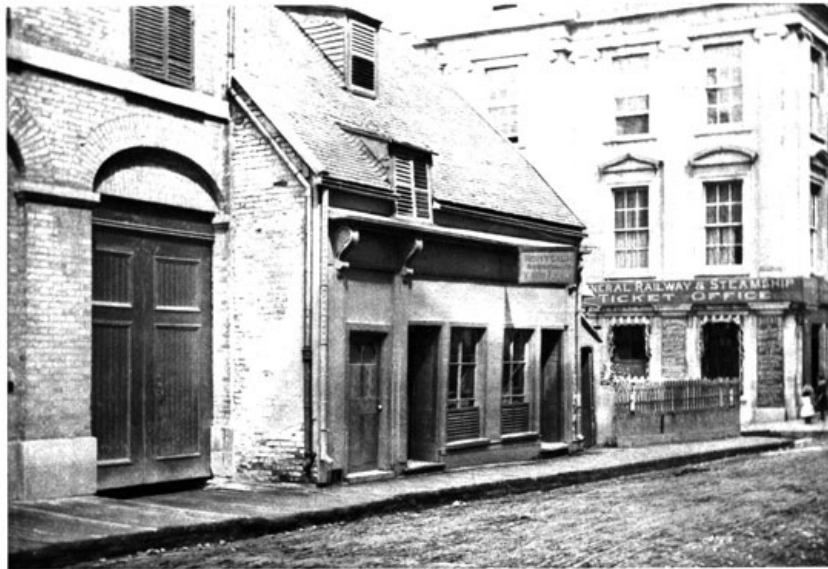
Montcalm's Headquarters, Quebec