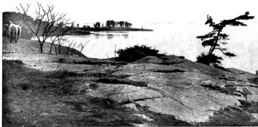
In the Thousand Islands, St. Lawrence