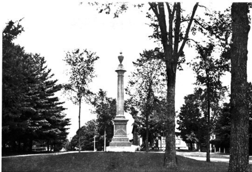
Monument to Jonathan Edwards, Stockbridge, Mass.

Upon the green village main street is Edwards' little old wooden house, having three small windows above the ponderous door. It is now called "Edwards Hall," and a granite obelisk out in front, erected by his descendants in 1871, preserves the memory of the great divine. Over opposite is the venerable Sedgwick Mansion, the home of the famous Sedgwick family. Farther up the street is the Cemetery, where the most interesting feature is the enclosure set apart for their tombs, the graves being arranged in circles around the central tomb of Judge Theodore Sedgwick, the founder. He was a native of Hartford, born in 1746, migrated to Sheffield in Berkshire, and finally settled at Stockbridge after the Revolution, becoming one of the leading statesmen of New England, prominent in the old Federal party, Member of Congress and Senator from Massachusetts, and Speaker of the House. He was subsequently made Judge of the Massachusetts Supreme Court, dying in office in 1813. His children and descendants surround his grave, among them his daughter, the distinguished authoress, Catherine Maria Sedgwick, born at Stockbridge in 1789, who died in 1867.