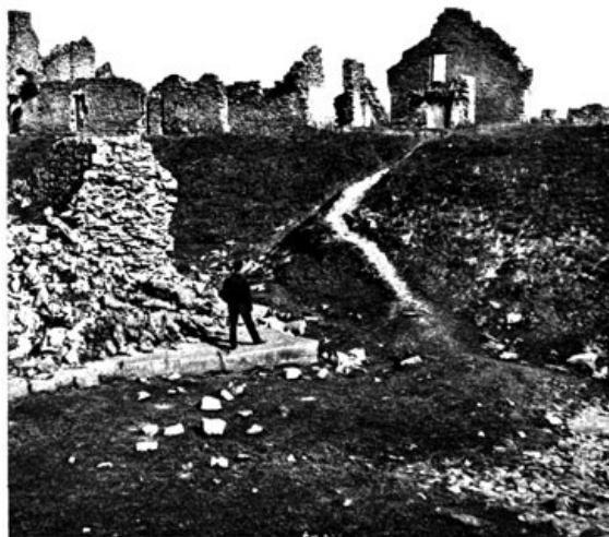
Old Fort Ticonderoga

Ticonderoga has since fallen into utter decay, but parts of the ruins are now preserved as a national memorial. A portion of wall and a dilapidated gable enclosing a window still stand, and make a picturesque ruin on top of a high slope rising from Lake Champlain, with a background of timbered hills. These forests to the west and south have grown during the nineteenth century, and are full of the remains of the old redoubts and entrenchments. Well-defined dry ditches are traced beyond the ramparts, with the barrack walls surrounding the parade-ground, an old well, and also the sally-port on the water side where Allen and his bold Green Mountain boys effected their entrance. During many years after the fort fell into ruins, the neighbors carried off its well-cut brick and stone work to build the growing villages on Lake Champlain's shores. All the surroundings are now eminently peaceful. The invaders, no longer warlike, are on pleasure bent; the inhabitants make paper and textiles, saw lumber, and also manufacture good lead-pencils from graphite found nearby. Sheep contentedly browse amid the relics of the great fortress, and vividly recall Browning's pastoral: