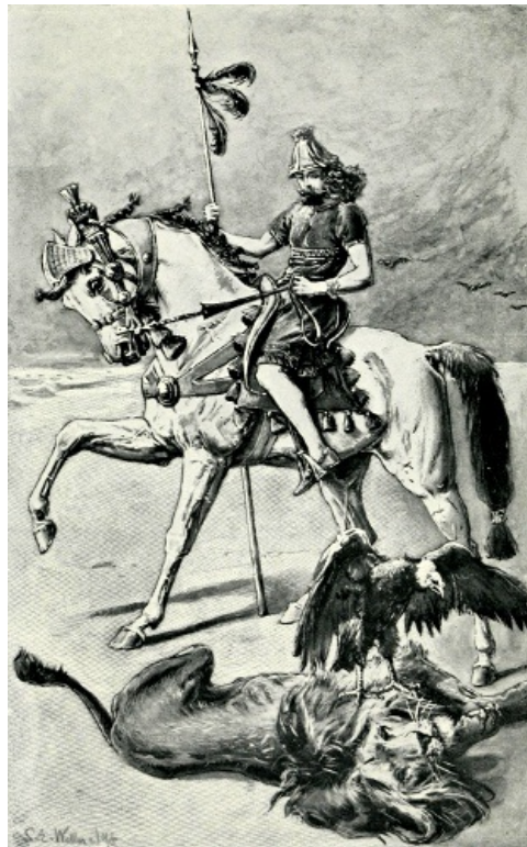
"THE STARTLED HORSEMAN DREW REIN."