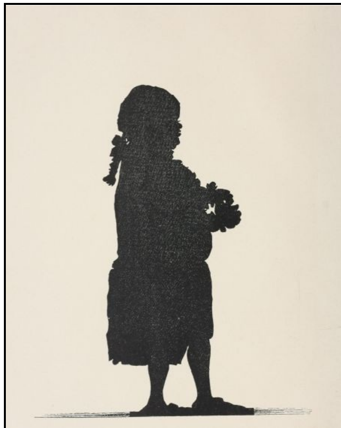
SILHOUETTE PORTRAIT OF EDWARD GIBBON.