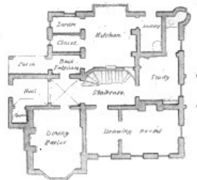
A VICARAGE HOUSE.