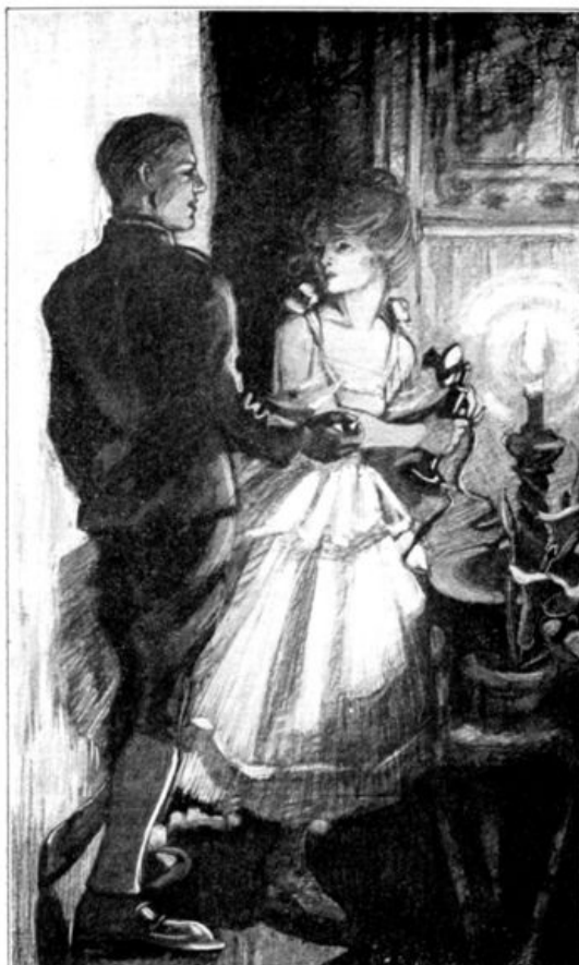
SLENDER FINGERS THRUST HIS HAND ASIDE.

As the boy reached his hand for the instrument there was a quick step beside him and slender fingers were thrust forward to push his hand aside.