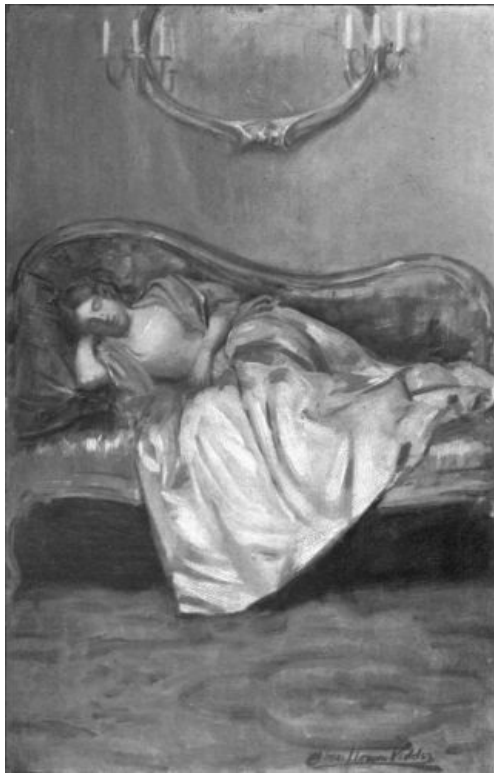
"SHE LAY CURLED UPON THE SOFA IN THE BACK DRAWING-ROOM."—P. 1. North and South.