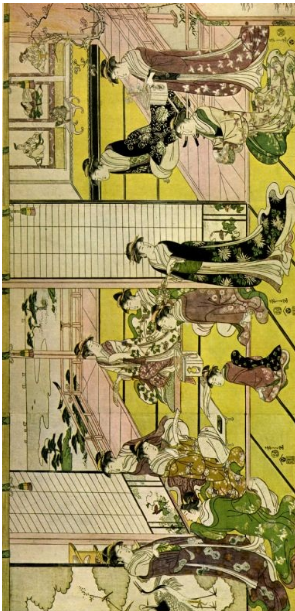
EISHI. Fête in a nobleman's palace.