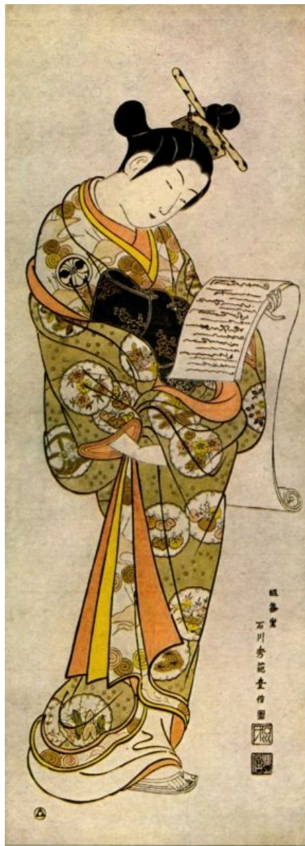
TOYONOBU. Actor reading Letter