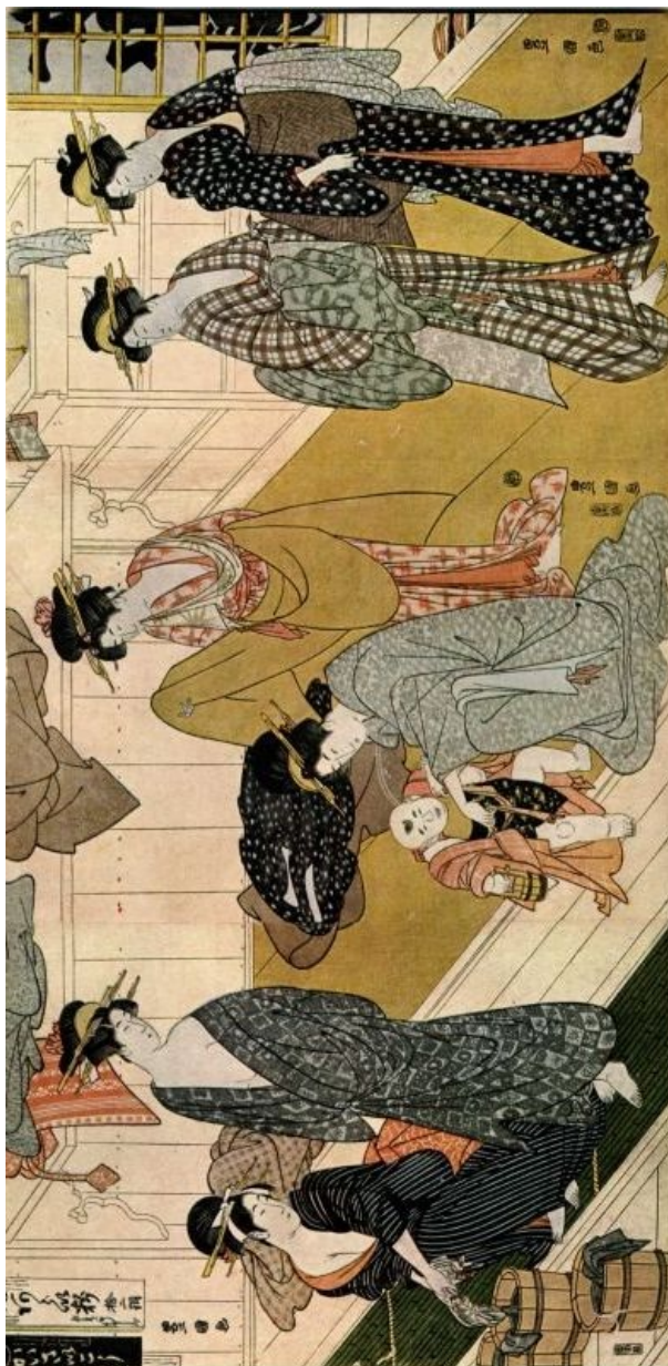
TOYOKUNI. Women in Bath House.

212 Triptych . Lady emerging from a kago; her attendants grouped about her.