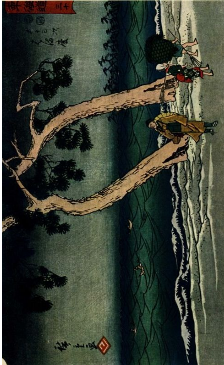
HIROSHIGE. Pines at Hammamatsu.