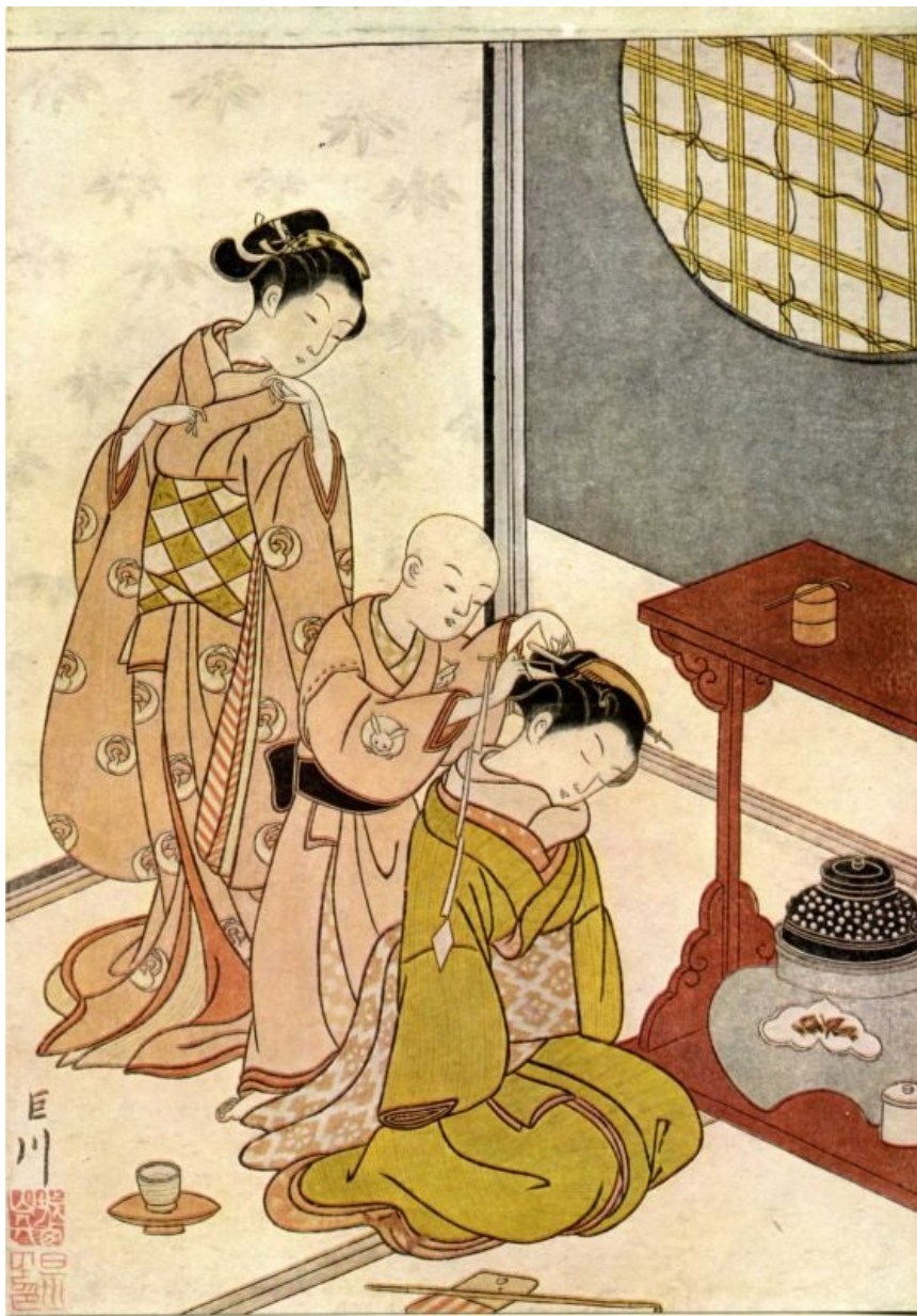
HARUNOBU. The Sleeping Elder Sister.

I have left myself little time to speak of two eminent artists, both of them world-renowned, who by their genius made the latter years of the Ukiyoé school as notable in their way as any in its entire history. Either Hokusai or Hiroshige might well engage our attention for an entire evening. Both were extraordinarily prolific; Hokusai was the more versatile and has the wider reputation. Both are among the greatest landscape artists the world has ever known. Their numerous prints of landscapes are a revelation of the possibilities of originality in composition and variety of interest in this field. Unless one has studied these prints in fine examples, it is impossible to realize how great is their merit. This is true of all the prints, but particularly true of Hiroshige's. Between the best impressions and the very good ones the difference is really astonishing. But the best are so extremely rare as to make it probable that because of the difficulty and the cost of printing, very few of them were issued—the publishers finding cheaper editions more profitable.