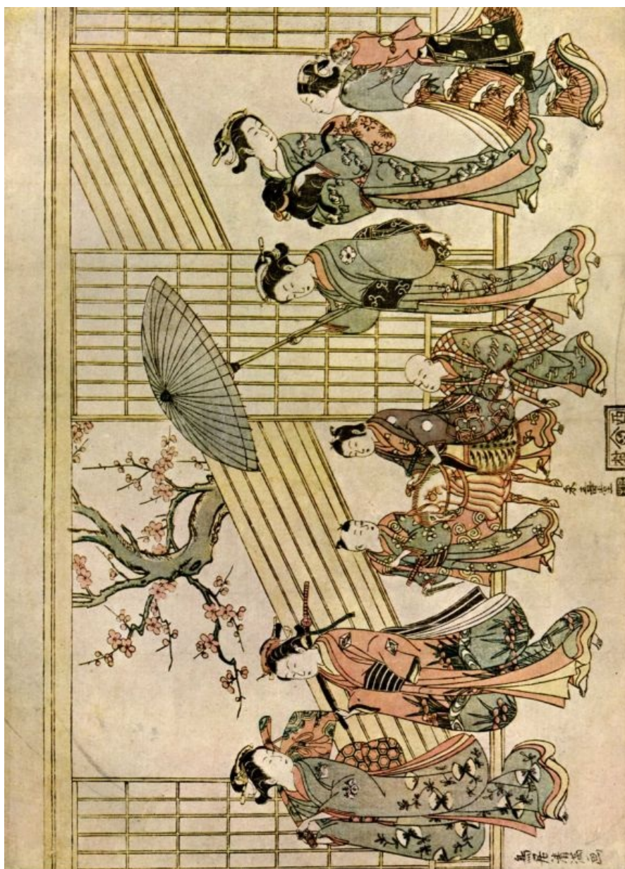
KIYOMITSU. Daimyo Procession Game.

invented the hashira-yé, or pillar-print, and had also put forth a series of prints that show a fair understanding of the laws of linear perspective to which he gave the name of Ukiyé. Being an artist as well as a publisher, Masanobu perceived that the change in process called for a change in the style of the designs. The very first of the new prints, therefore, were characterized by finer and more exquisite detail than was suitable for the hand-coloured editions. The colours used were beni and a soft green; and the name beni-yé, which had been applied to the hand-coloured prints in which beni was used, was also given to them. A happier selection of colours could not have been made. By thinning the red and modifying the hue of the green a wide range of effects was secured. Almost every possible combination and variation was tried during the fourteen or fifteen years that the beni-yé were in vogue. The world is far richer because of this long period before the number of colour-blocks was increased, since time was afforded to work out the decorative possibilities resulting from the limitation to two colours and black and white. This limitation demanded fine skill and creative resource in the invention of pattern and the distribution of the colours employed. 4 The results achieved were remarkable. Until one has seen them it is impossible to realize that so much life and vivacity of colouring could be given by impressions from two blocks charged with rose and green.