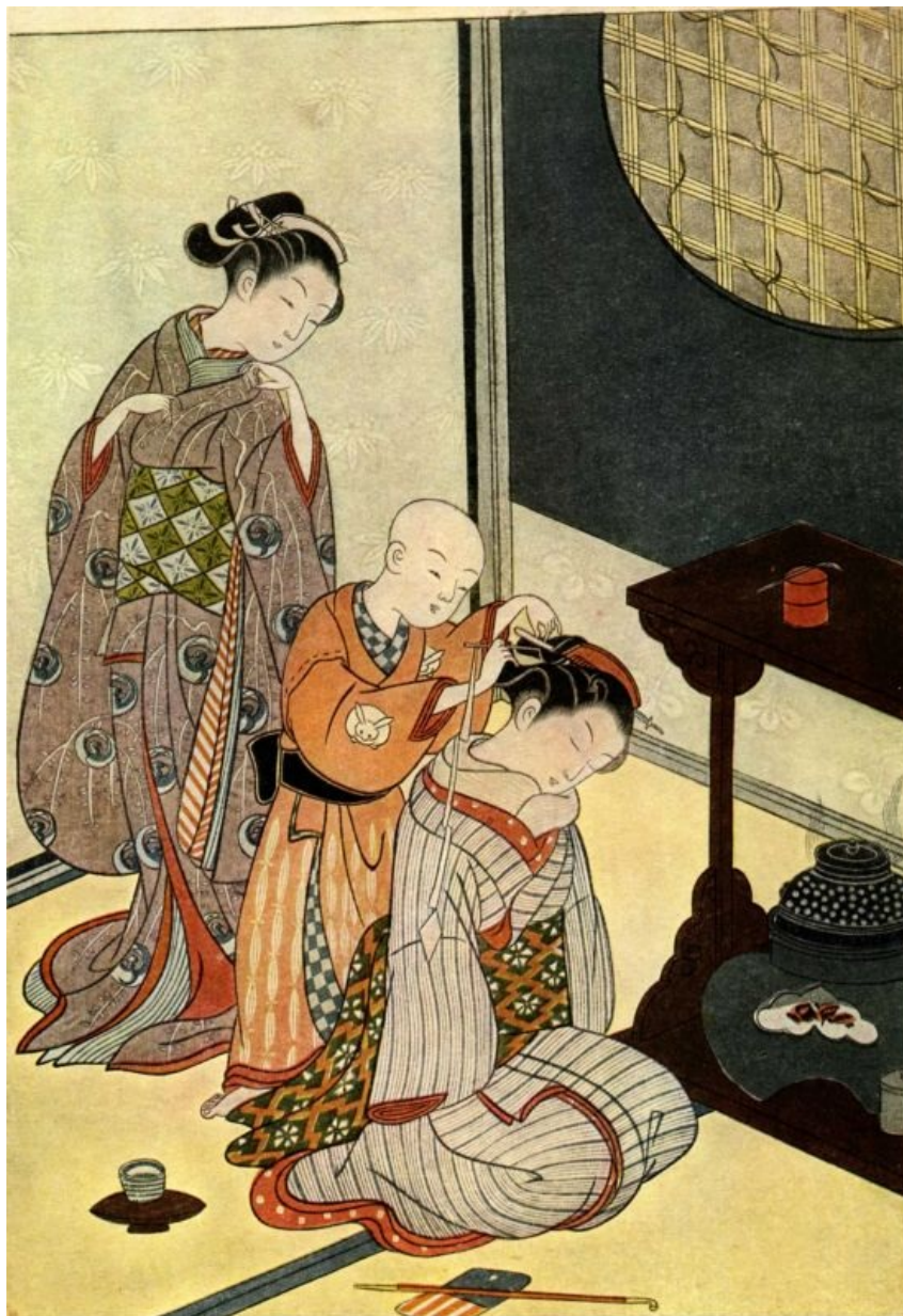
HARUNOBU. The Sleeping Elder Sister.