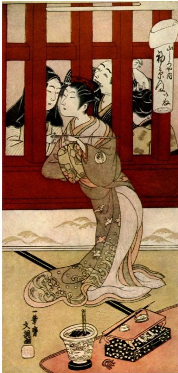
BUNCHO. Actor as Woman talking to Men.