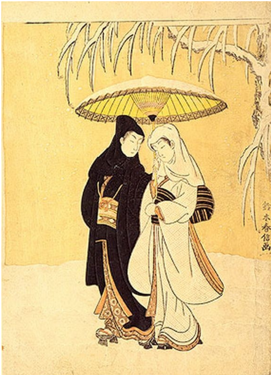
HARUNOBU. Lovers walking in Snow.

*** START OF THE PROJECT GUTENBERG EBOOK JAPANESE COLOUR-PRINTS AND THEIR DESIGNERS ***