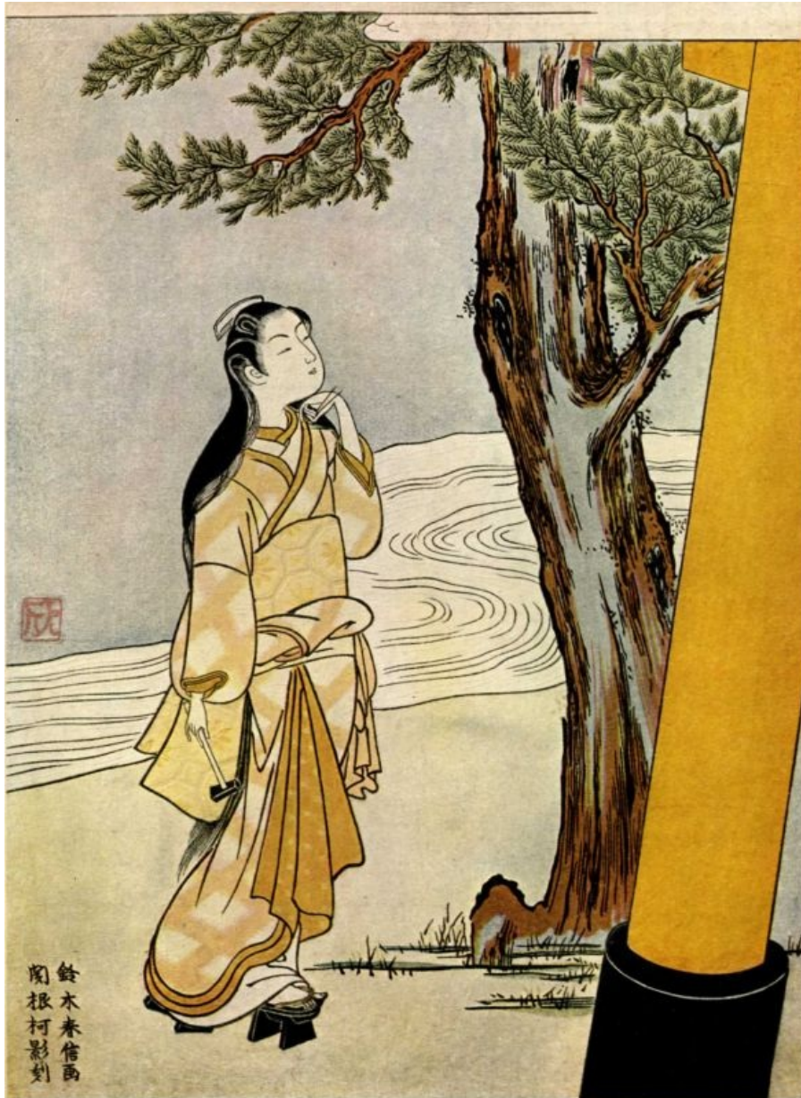
HARUNOBU. Young Woman before Torii.

The name of Suzuki Harunobu is familiar to every admirer of Japanese prints. It is in large measure to his genius that the development of full-colour printing is due. He was not only the first artist to make use of the new process, but he took advantage of it to bring out prints of a novel type. Very dainty and graceful these were, and in the poetic allusions or quiet humour with which they were charged, and in the quality of the brush-strokes with which the drawings were executed, they made a direct appeal to men of taste. Success was instantaneous. By the year 1765 Harunobu had come to the front and distanced all competitors for popular favour. The serenity and compelling charm of his compositions brought him wide fame. Realizing the possibilities that now lay before him, he proudly exclaimed, "Why should I degrade myself by the delineation of actors?" His ambition, he said, was to become "the true successor of the painters