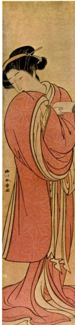
SHUNSHO. Woman in Red.

The leading masters of the Ukiyoé school were a group of very great artists. The names of Kiyonaga, Harunobu, Okumura Masanobu, Utamaro, Hokusai, and Hiroshige belong in the category of those whose fame is world-wide.