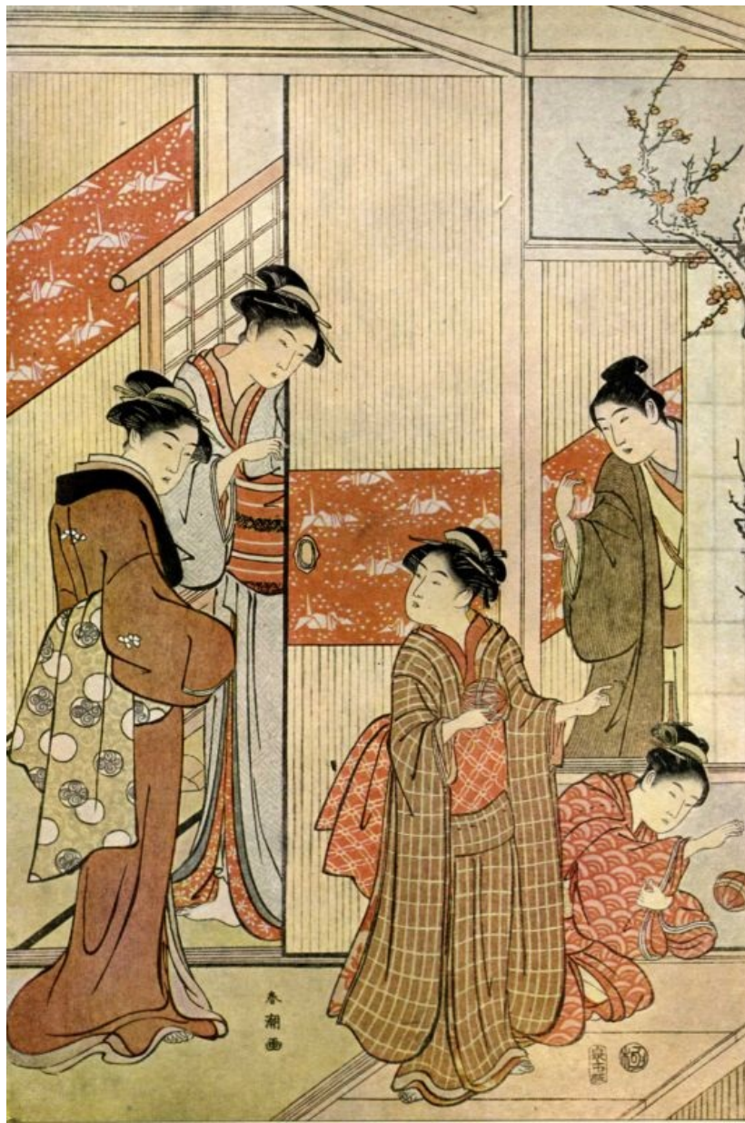
SHUNCHO. Women watching Girls bouncing Balls.