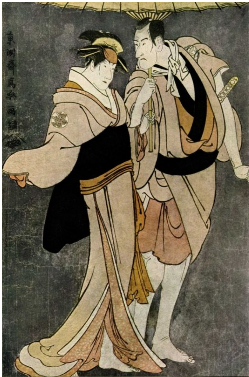
SHARAKU. Two Actors.