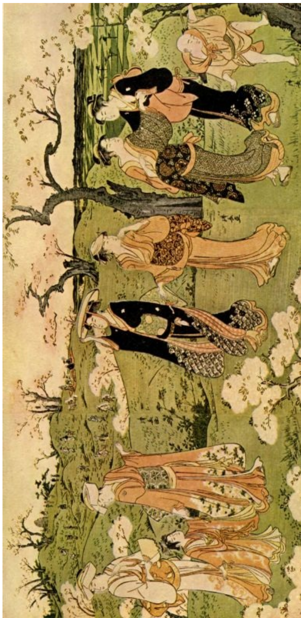
KIYONAGA. Picnic Party.

Pupil of Kiyomasu. His known works are exclusively beni-yé , executed from about 1745 to about 1755.