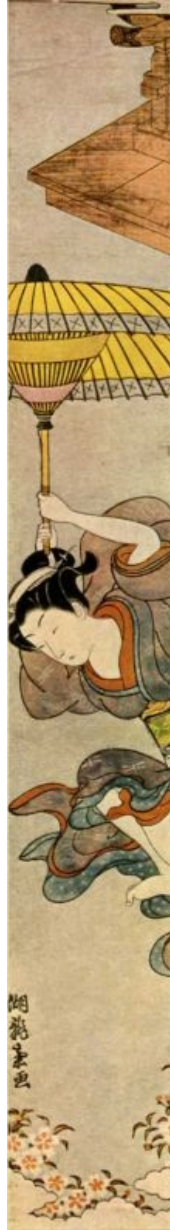
KORYUSAI. Musume leaping from Temple Balcony.