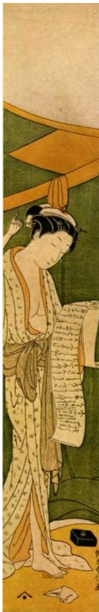
HARUNOBU. Woman reading Letter.

spent in the capital, they usually carried with them large quantities of prints. Country people visiting Yedo rarely returned without taking many of these cheap souvenirs of the city to distribute among their neighbours. Of course many were destroyed, but the Japanese have always been accustomed to take care of their possessions, and so many thousands of prints were neatly packed away in boxes and placed in the kuras, or fireproof storehouses. There they were often spoiled by mildew, the dread foe of the Japanese housewife, and eaten by insects. Those pasted in albums, as were many of the noted series by Hokusai and Hiroshige, fared better than the loose ones.