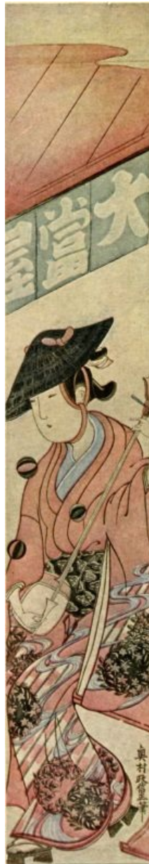
MASANOBU. Geisha playing Samisen.

Even to-day inherited prejudice prevents wide-spread appreciation of the prints in the land of their origin. Our enthusiastic admiration is still more or less a mystery to our neighbours across the Pacific. Only now, when most of the fine prints have passed into the hands of European and American collectors, are the Japanese connoisseurs beginning to understand how it is that the Western art-lover, unfettered by any traditional point of view and not disturbed by any meanings the subject may hold or suggest, is able to perceive the glorious colour, the superb composition, the masterly treatment and rare beauty to which they have been blind.