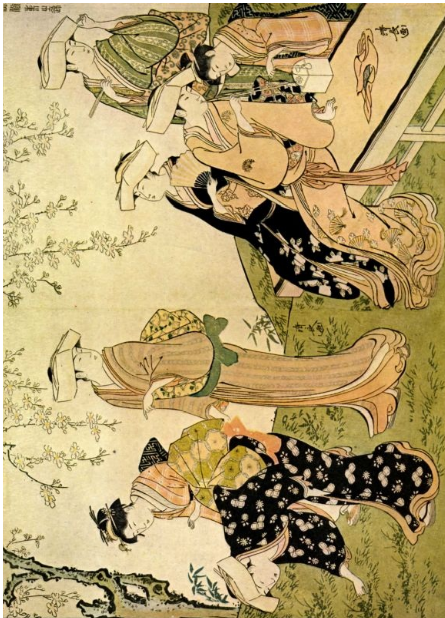
KIYONAGA. Holiday Group at Gotenyama.