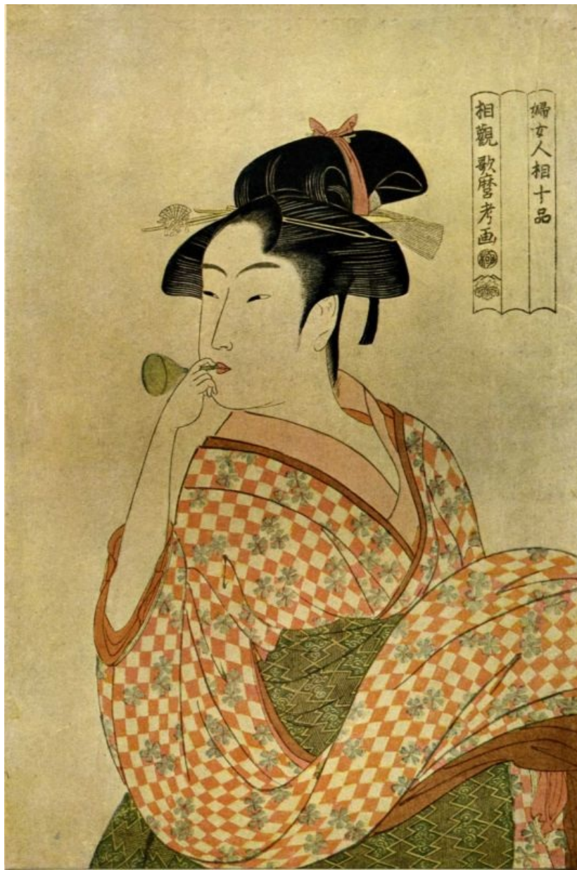
UTAMARO. Woman with a Musical Toy.