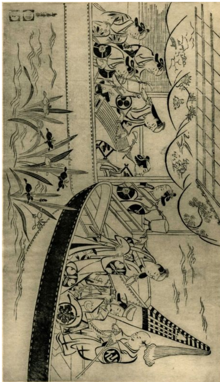
KIYOMASU. Actors' Boating Party

Many of the prints produced during the early years of the eighteenth century were large single figures of actors, geishas, and women of the Yoshiwara. These were broadly treated, with strong, free brush-strokes based upon the technique of the Kano masters and quite different from Moronobu's style, which was more nearly like that of the Tosa painters. Each of the classical schools, I may explain, had its own peculiar methods, for which brushes of special shape were required. In their spontaneity, their freedom, their glorious sweep of line, these prints are among the finest works of the Ukiyoé school. Among them are many masterpieces of linear composition. Yet by the people of the upper classes they were regarded as hopelessly vulgar. Though the Kano painters used similar sweeping strokes, they laid great stress upon carefully modulated tone. The notan , or lightness and darkness of the ink in different parts of the drawing, was an essential quality. It should not be confused with chiaroscuro , the science of light and shade. Notan signifies merely difference in lightness and darkness of tone. In the early prints this did not appear. All the lines were uniformly black. And the addition of colouring which was looked upon as coarse and gaudy was a further offence to persons of refined taste.