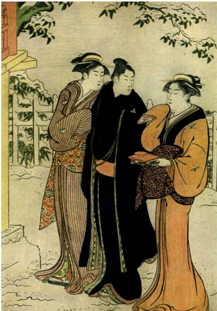
KIYONAGA. Man and two Women approaching Temple.