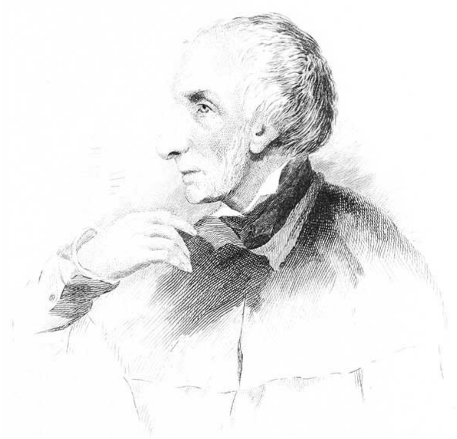
William Wordsworth after Margaret Gillies