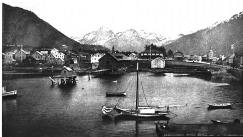
Sitka, Alaska, from the Sea

Within Alaska, the route of exploration continues through Clarence Strait to the Alexander Archipelago, comprising several thousand islands, many of which are mountainous, and about eleven hundred of the larger ones have been charted. Here is Fort Wrangell, seven hundred miles from Victoria, on one of the islands, a little settlement named after Baron Wrangell, the Russian Governor of Alaska in 1834. Upon landing, the visitors see the Indians and their chief curiosity, the "totem poles," erected in front of their houses, and carved with rude figures emblematic of the owner and his ancestors. These poles are twenty to sixty feet in height, and two to five feet in diameter. The natives are divided into clans, of which the Whale, the Eagle, the Wolf and the