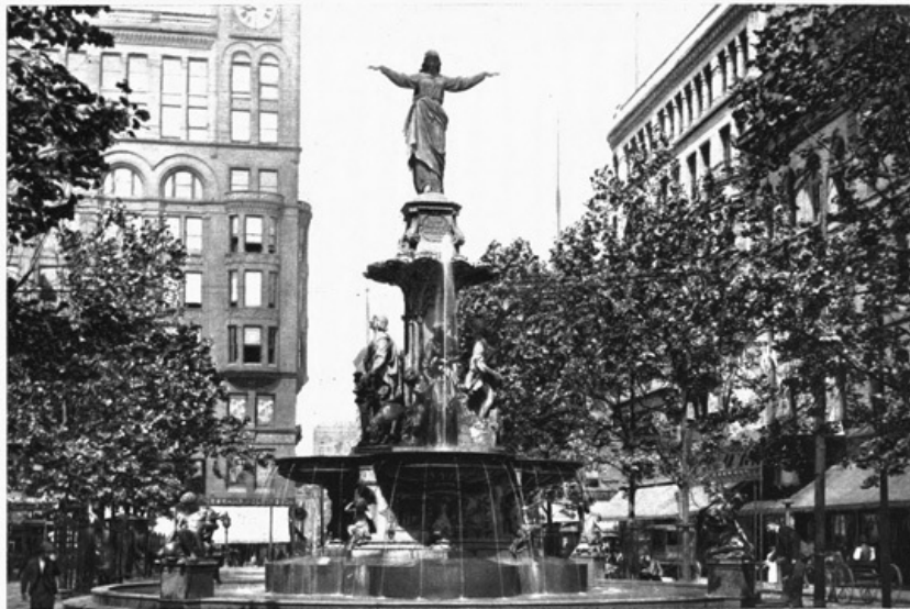
Tyler-Davidson Fountain, Cincinnati, O.

Cincinnati, crossing over to the Kentucky shore at Covington and Newport, where there are seventy thousand people, the United States military post of Fort Thomas being upon the hills behind Newport. Up the Great Miami, sixty miles to the northward, and at its confluence with Mad River, is Dayton, a busy manufacturing and railway centre, having seventy thousand people. It is the location of the Central National Soldiers' Home, where there are several thousand old soldiers, the spacious buildings, in an attractive park of seven hundred acres, standing prominently on the hills sloping up from the Miami River to the westward of the city.