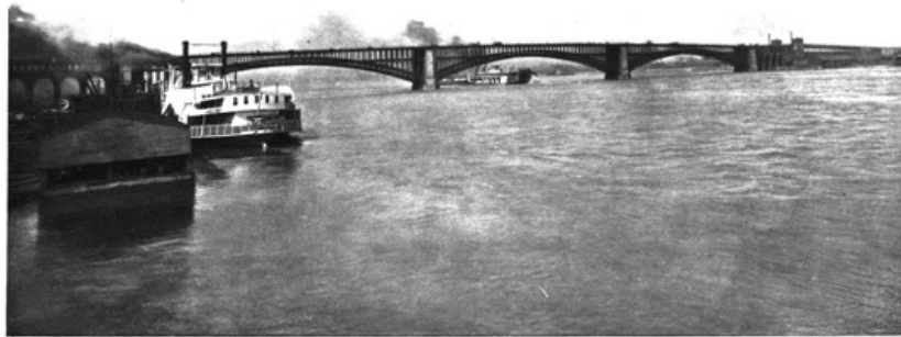
Bridge Crossing the Mississippi at St. Louis