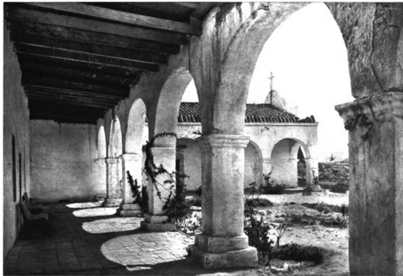
Cloister of Mission, San Juan Capistrano