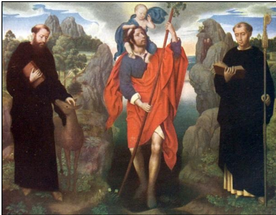
PLATE III.—SAINTS CHRISTOPHER, MAURUS, AND GILES.