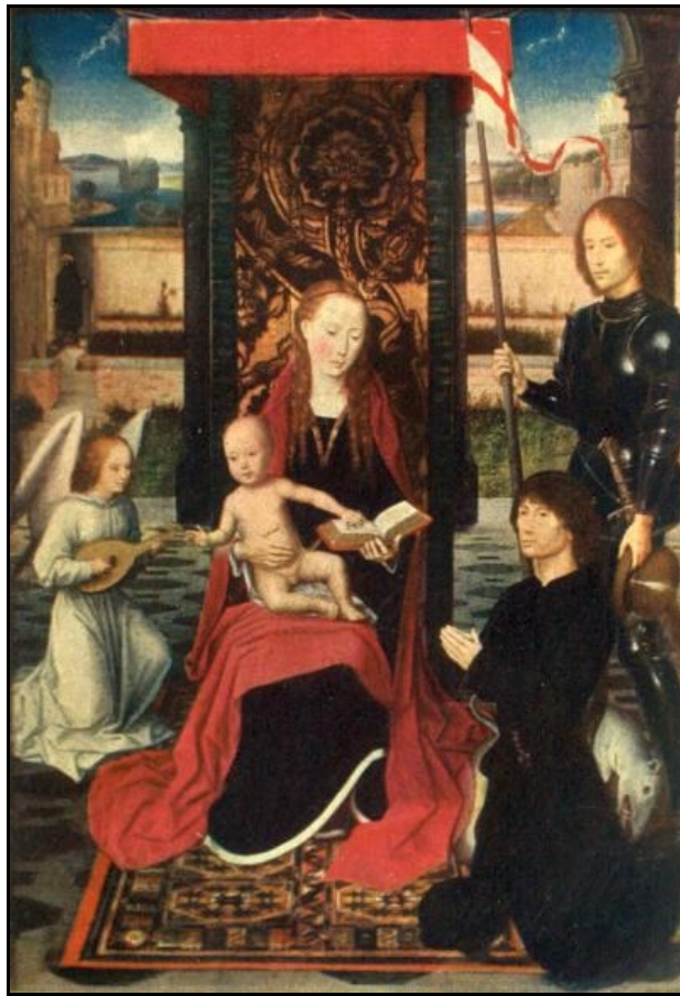
PLATE VIII.—OUR LADY AND CHILD, SAINT GEORGE AND THE DONOR.