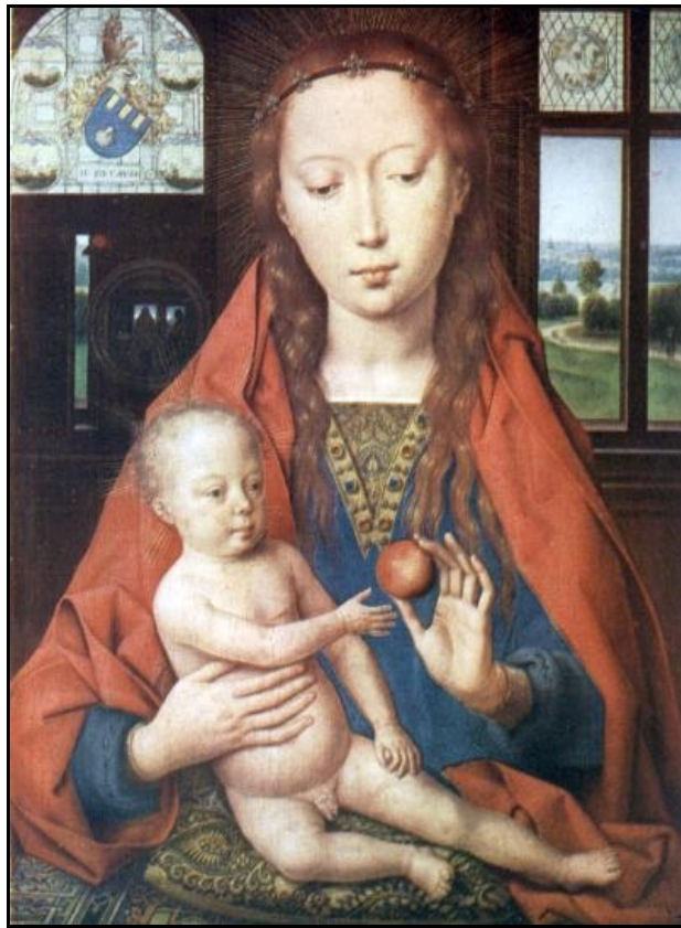
PLATE I.—OUR LADY AND CHILD. (frontispiece)