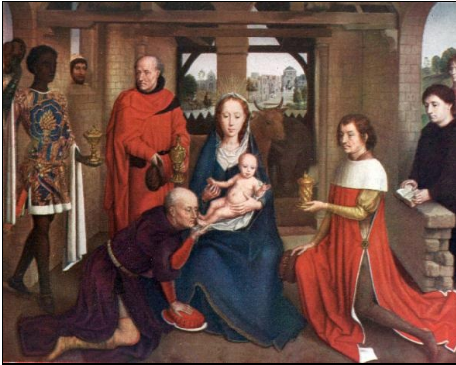
PLATE II.—ADORATION OF THE MAGI.