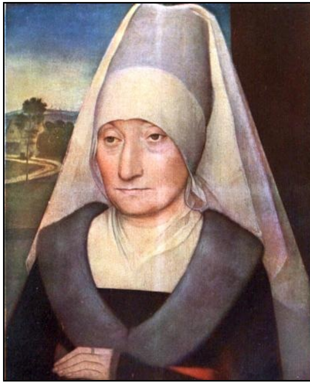
PLATE VII.—AN OLD LADY.

This fine portrait, with its companion, was formerly in the Meazza collection at Milan, dispersed in 1884. It was exhibited at Bruges in 1902 (No. 71), since when it has been purchased by the Louvre, where it is now to be seen. The companion portrait is in the Berlin Museum.