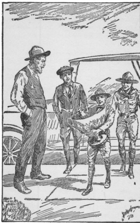
I NEVER SAW HIM LOOK SO SMALL AS HE DID WITH THAT BIG LOAD.

And the constable— g-o-o-d night! There he stood, gaping at Pee-wee, while the rest of us began laughing, all except Harry. He acted just as if nothing had happened at all. "Now, if there's anything else missing in town," he said, "just let us know, and we'll get it. Speak while we're here, because in about fifteen minutes we're off for buried treasure. You see we used to make a specialty of German spies, but now there aren't any; things are dull since the war. Any little job-lot of mysteries you want unravelled? No? Oh, very well. We make a specialty of murders and kidnappings and Bolsheviki plots; we like Bolsheviki plots best of all. But we're not proud. We're always willing to take a little burglary case to accommodate some one. All right, Pee-wee, forward march—up the steps—and lookout you don't slip! Won't you join us, Constable? The more the merrier."