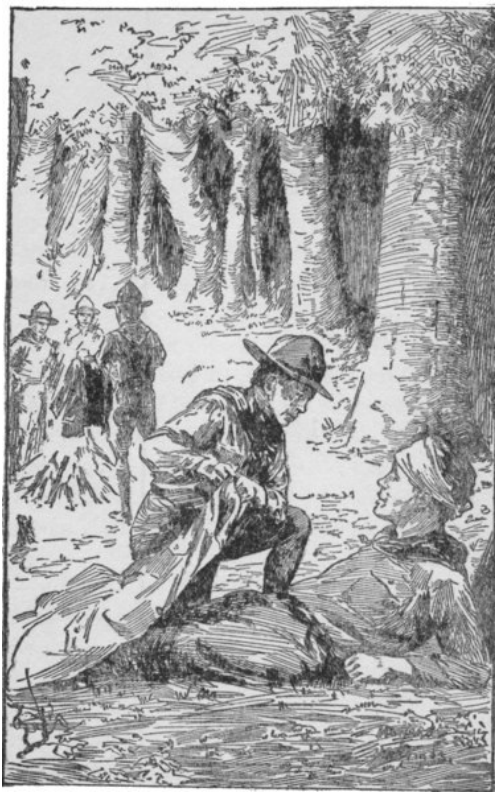
I JUST WANT TO PUT THE DRY COAT OVER YOU.