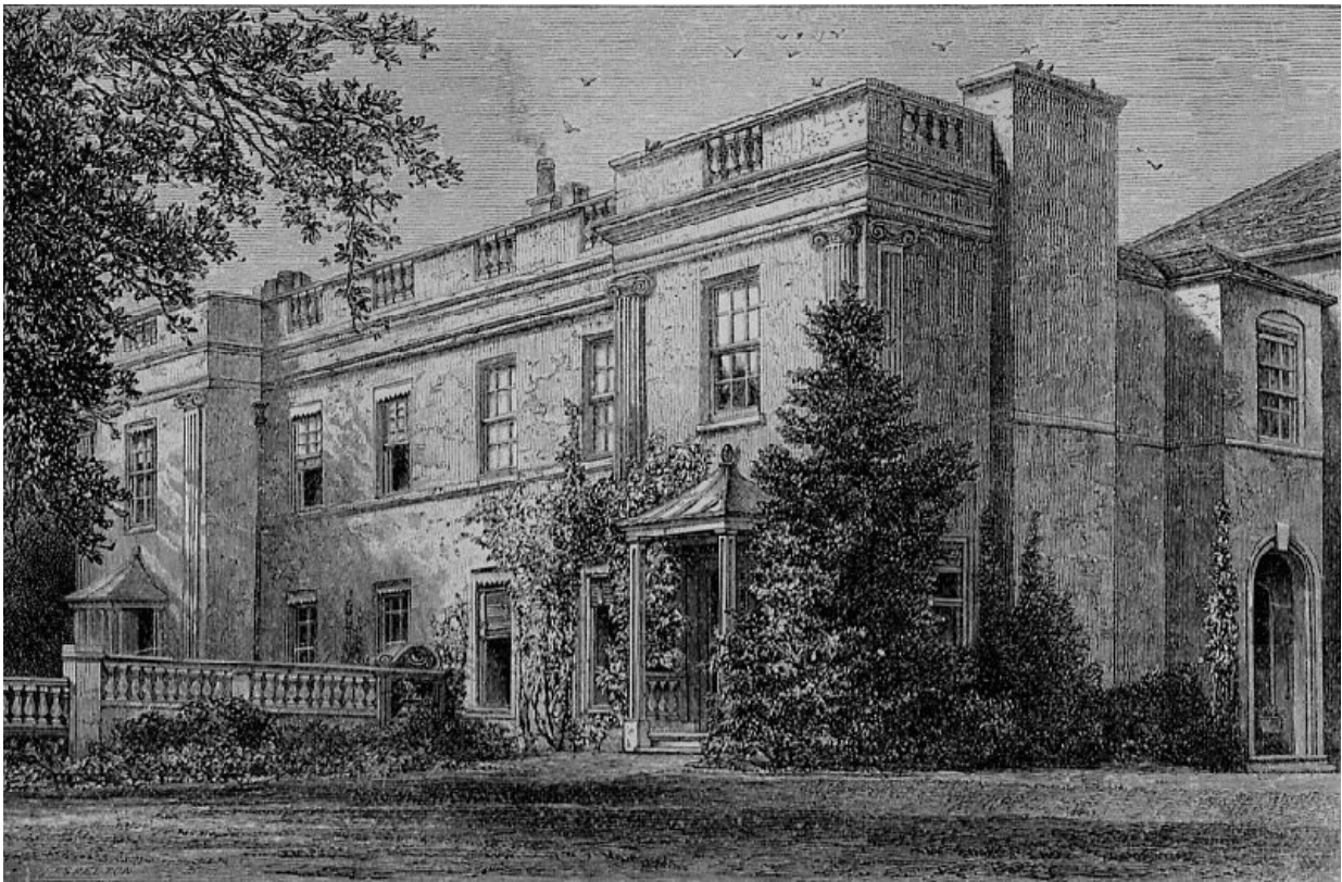
House in Folshill Road, Coventry."

The whole of last week was devoted to a bride's-maid's [17] duties, and each day of this has been partially occupied in paying or receiving visits. I have a calm in sea and sky that I doubt not will ere long be interrupted. This is not our rest, if we are among those for whom there remaineth one, and to pass through life without tribulation (or, as Jeremy Taylor beautifully says, with only such a measure of it as may be compared to an artificial discord in music, which nurses the ear for the returning harmony) would leave us destitute of one of the marks that invariably accompany salvation, and of that fellowship in the sufferings of the Redeemer which can alone work in us a resemblance to one of the most prominent parts of his divinely perfect character, and enable us to obey the injunction, "In patience possess your souls." I have often observed how, in secular things, active occupation in procuring the necessaries of life renders the character indifferent to trials not affecting that one object. There is an analogous influence produced in the Christian by a vigorous pursuit of duty, a determination to work while it is day.