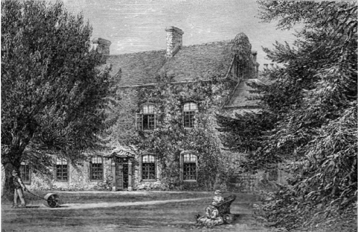
Griff House—Front View.

the shaking of looms, he might skirt a parish all of fields, high hedges, and deep-rutted lanes; after the coach had rattled over the pavement of a manufacturing town, the scene of riots and trades-union meetings, it would take him in another ten minutes into a rural region, where the neighborhood of the town was only felt in the advantages of a near market for corn, cheese, and hay, and where men with a considerable banking account were accustomed to say that 'they never meddled with politics themselves.'" [2]